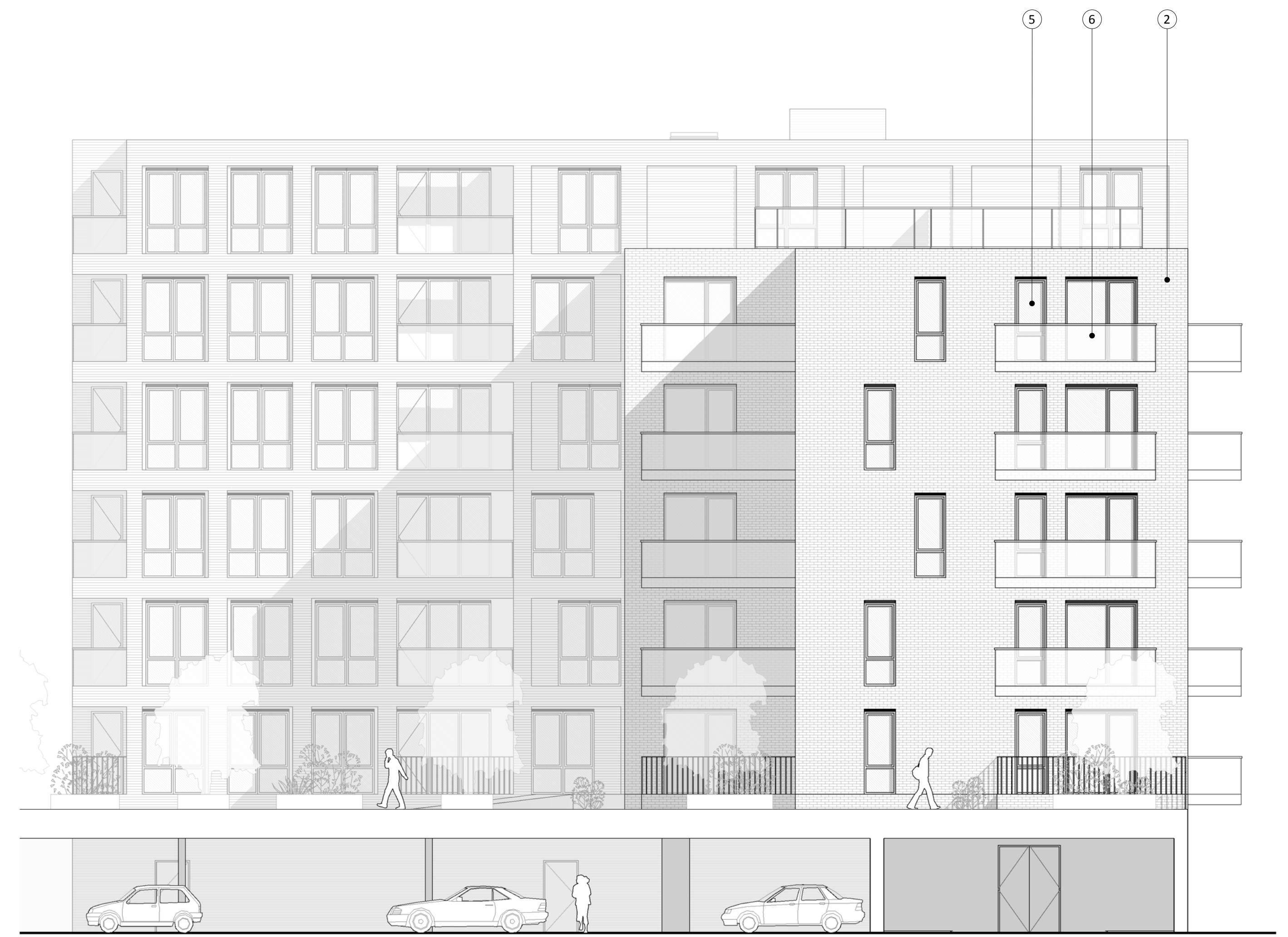
BLOCK 02 A