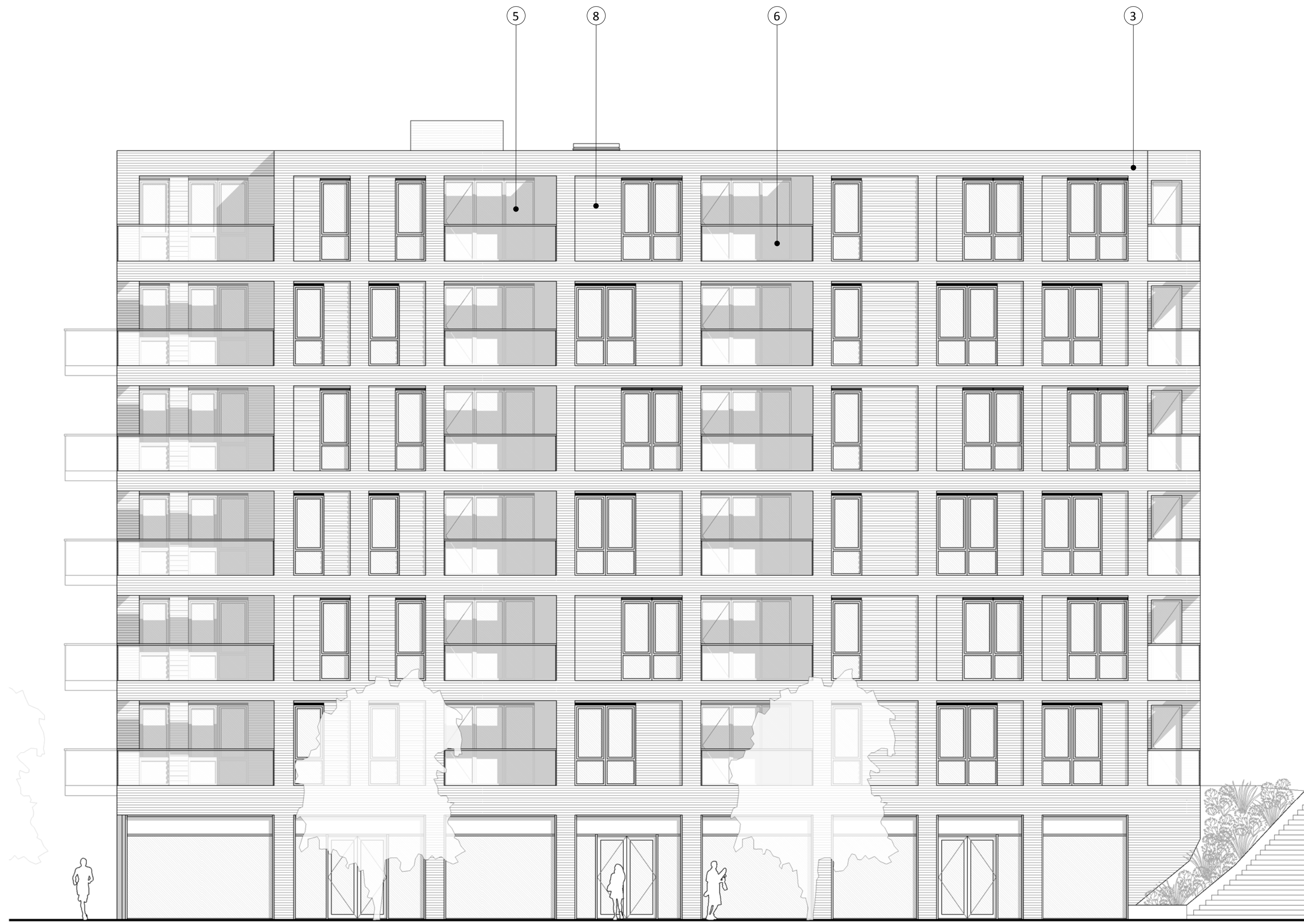
BLOCK 02 A