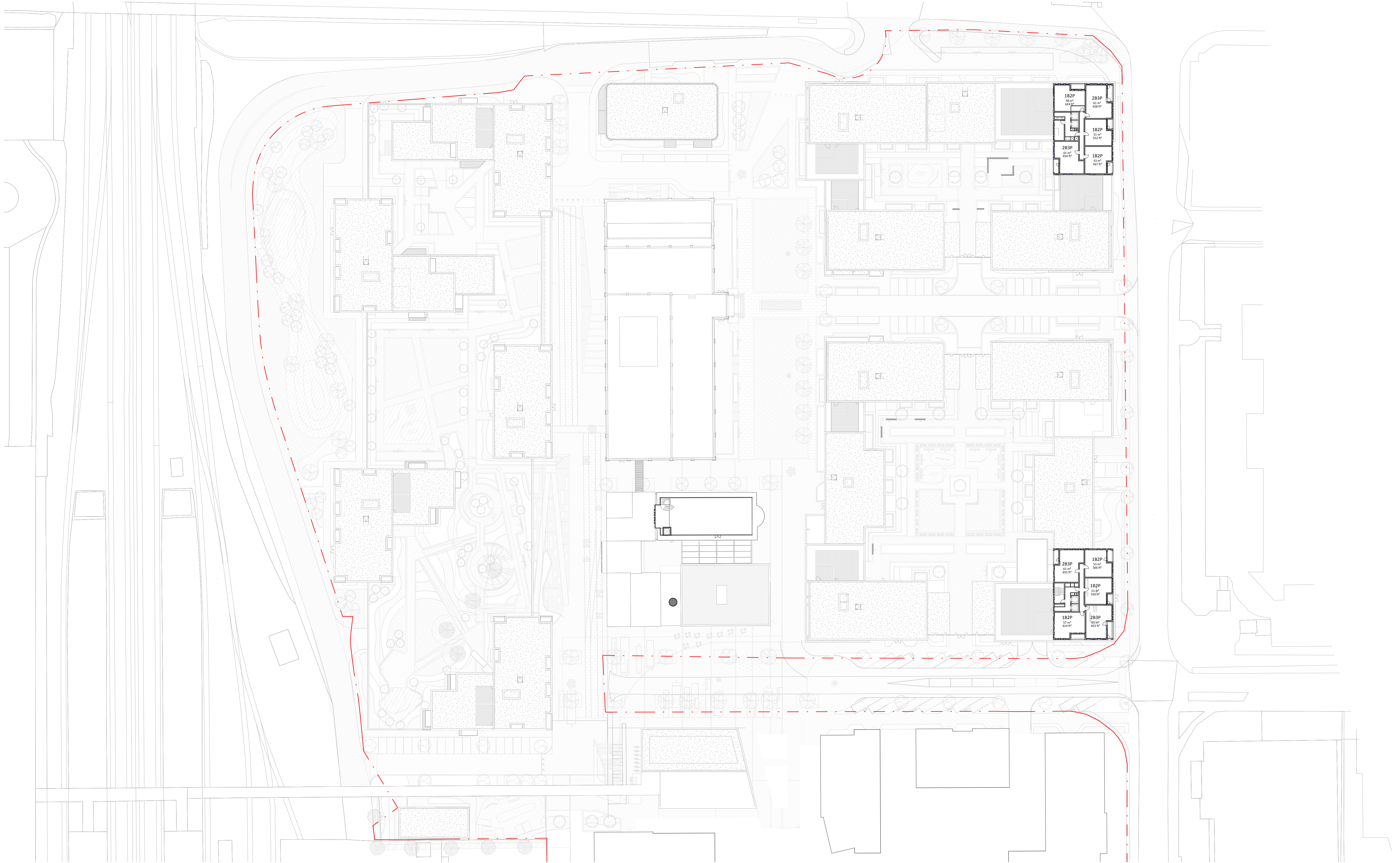
1 Eighth Floor Plan 1 : 500 @A1