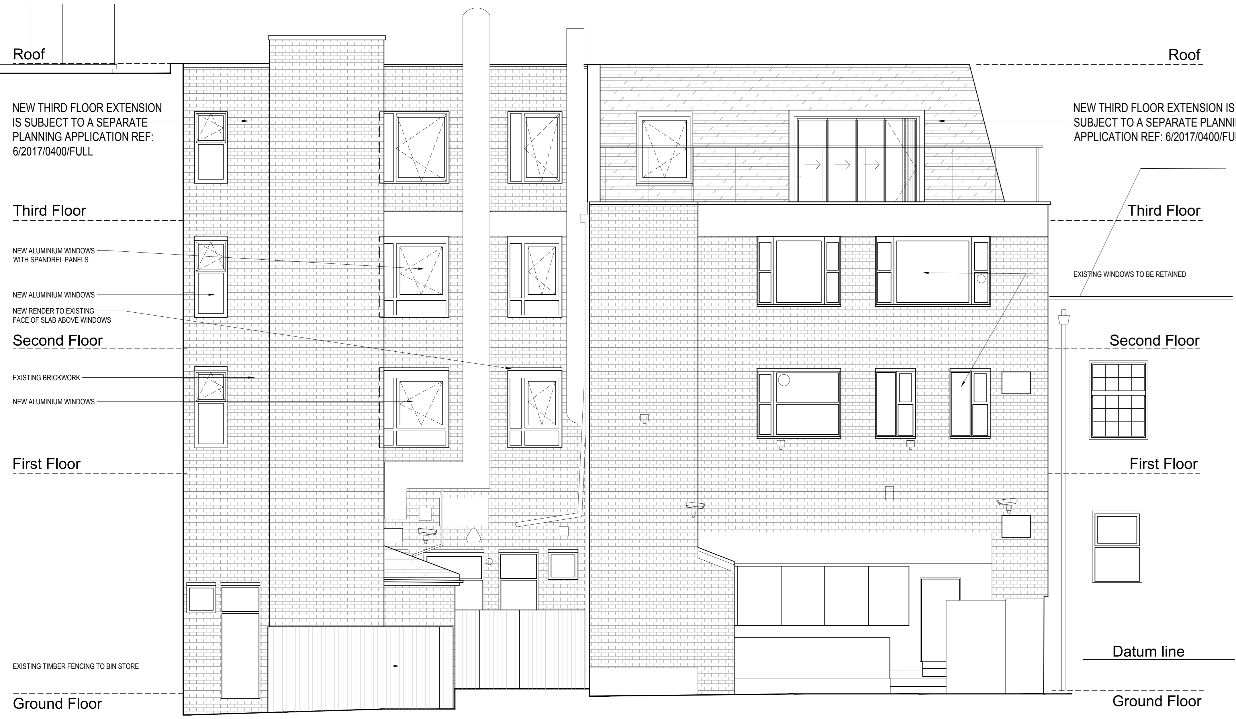
EAST ELEVATION SCALE: 1:50 @ A0