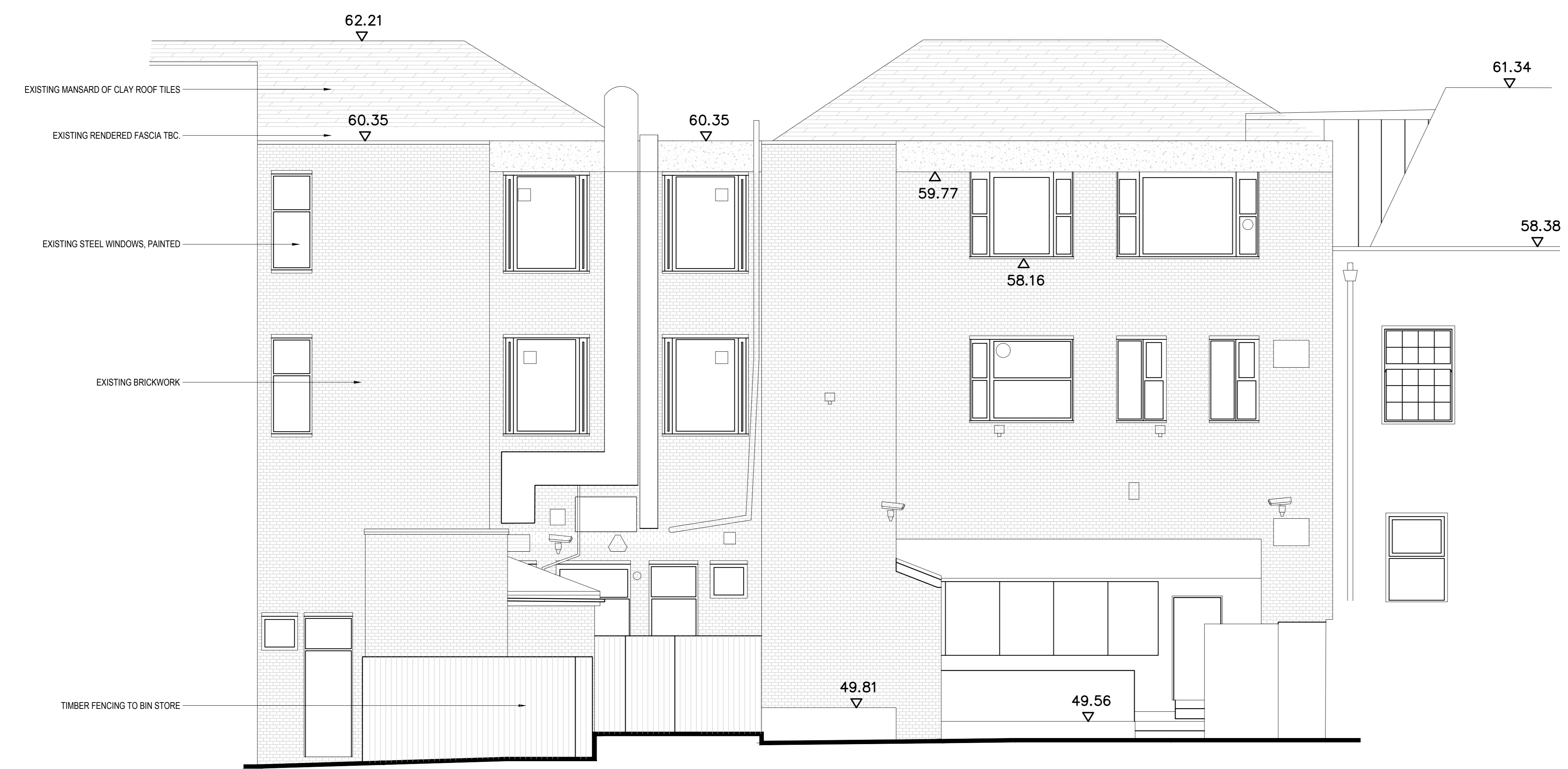
EAST ELEVATION SCALE: 1:50 @ A0

REAR ENTRANCE BUILT IN EARLY 2009 ACCORDING TO CONSENT N6/2004/1136/FP. WELWYN AUTHORITY CONSIDERS THE WORKS UNLAWFUL BECAUSE PRE-COMMENCEMENT CONDITIONS WERE NOT DISCHARGED. A SEPERATE APPLICATION HAS BEEN SUBMITTED TO REGULARISE THESE WORKS.