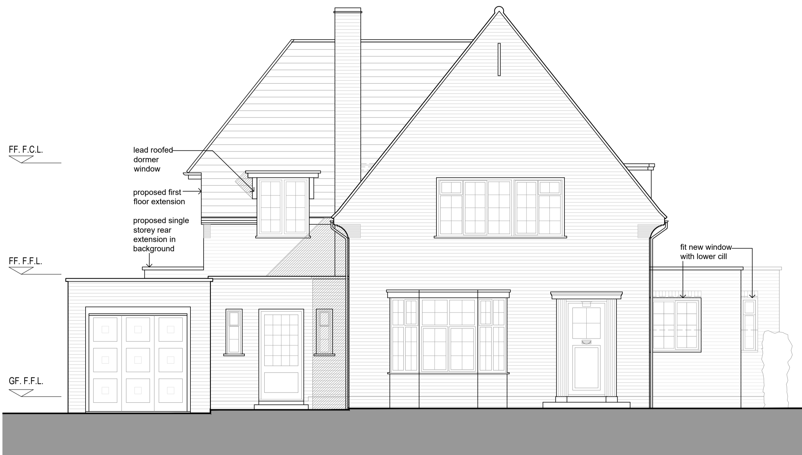
FRONT / NORTH EAST ELEVATION