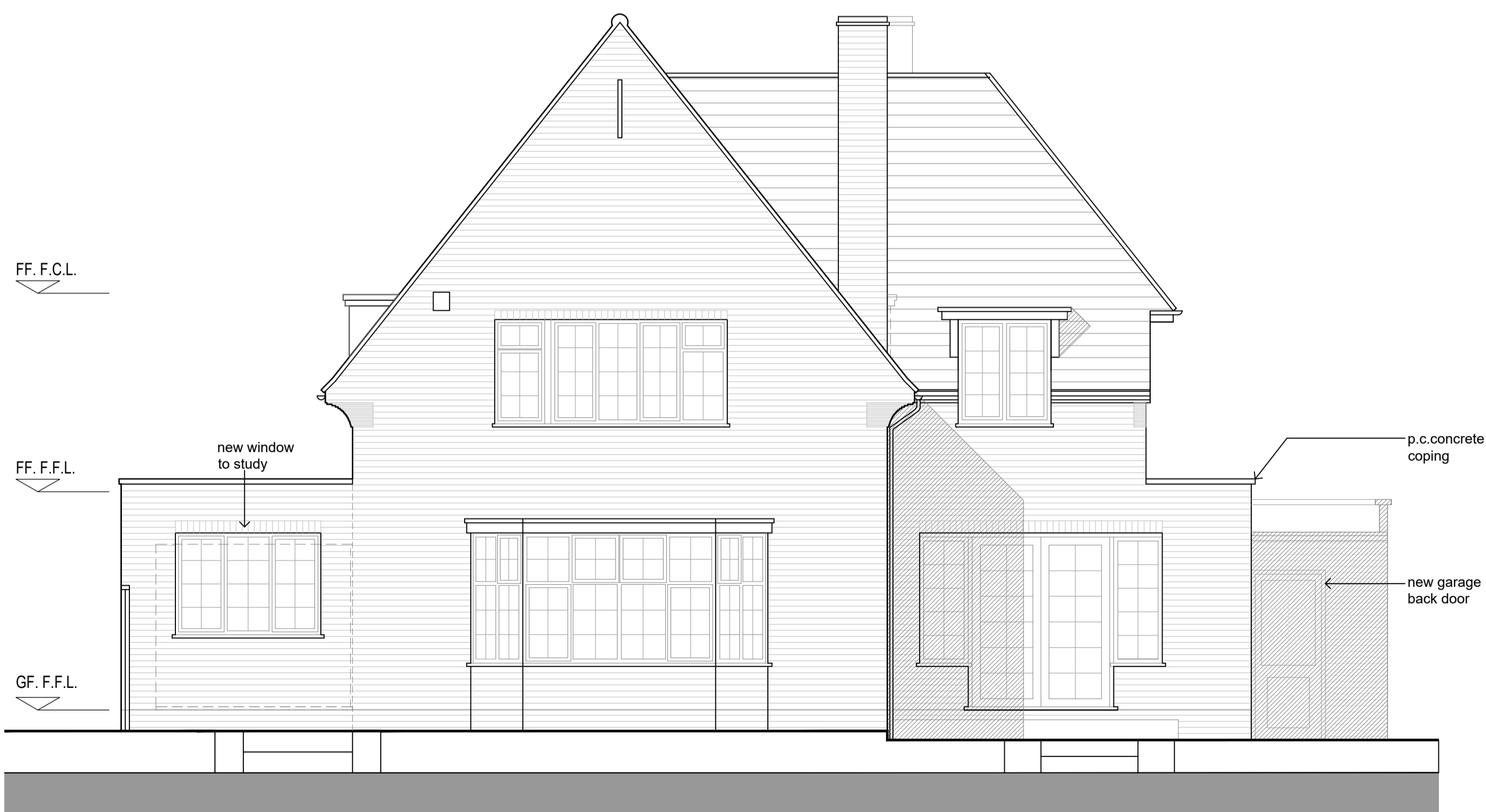
REAR / SOUTH WEST ELEVATION