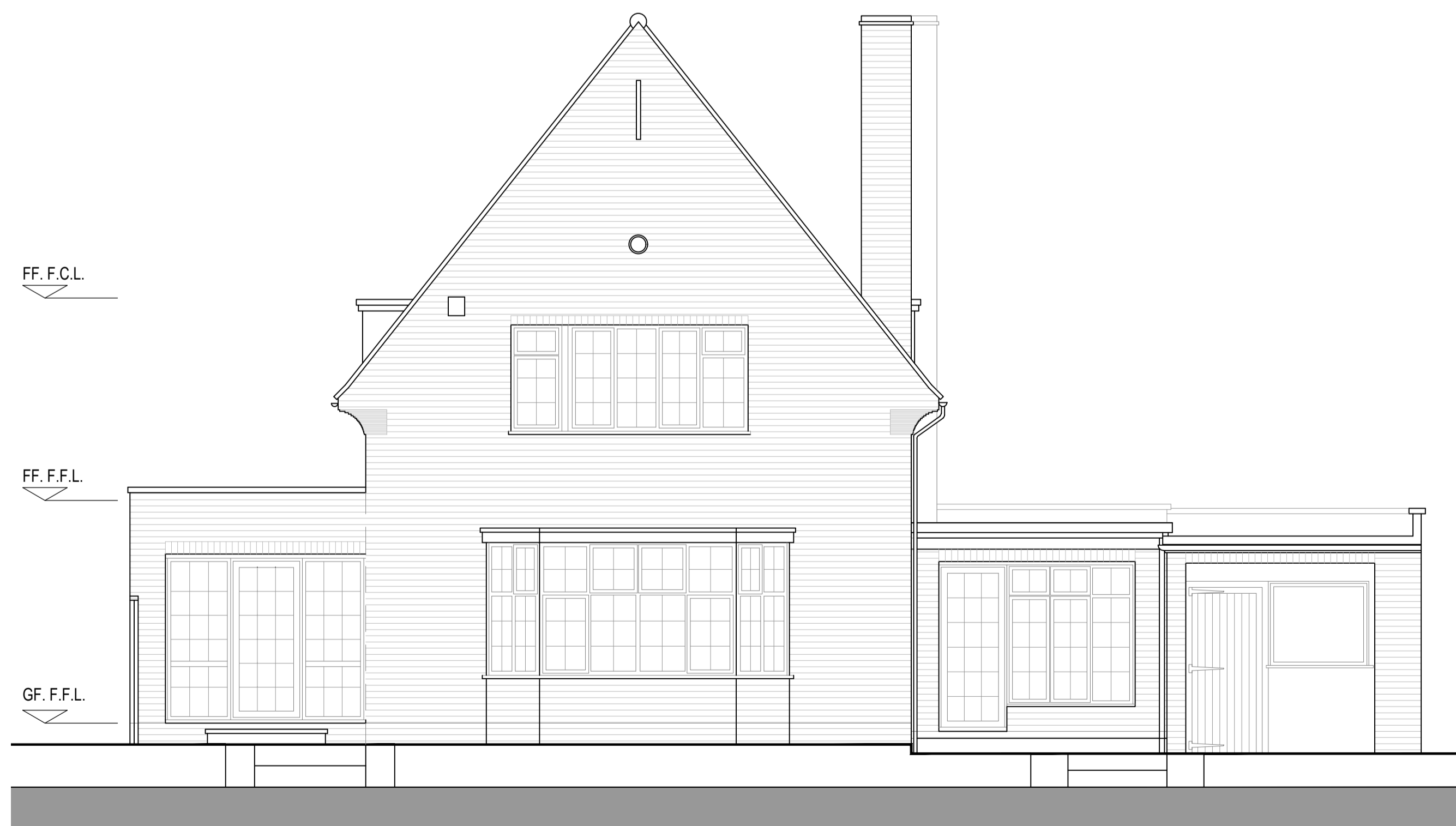
REAR / SOUTH WEST ELEVATION