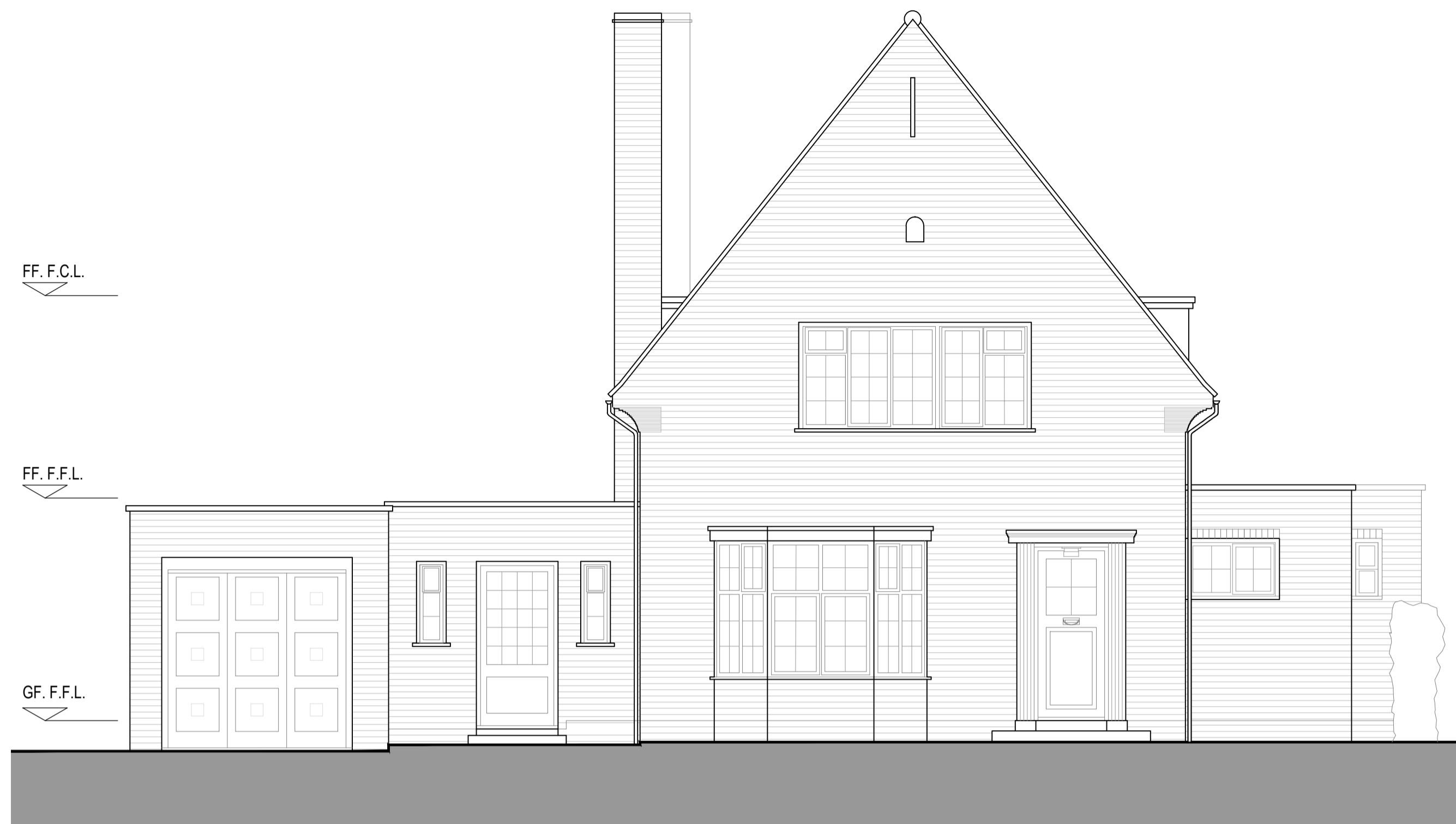
FRONT / NORTH EAST ELEVATION