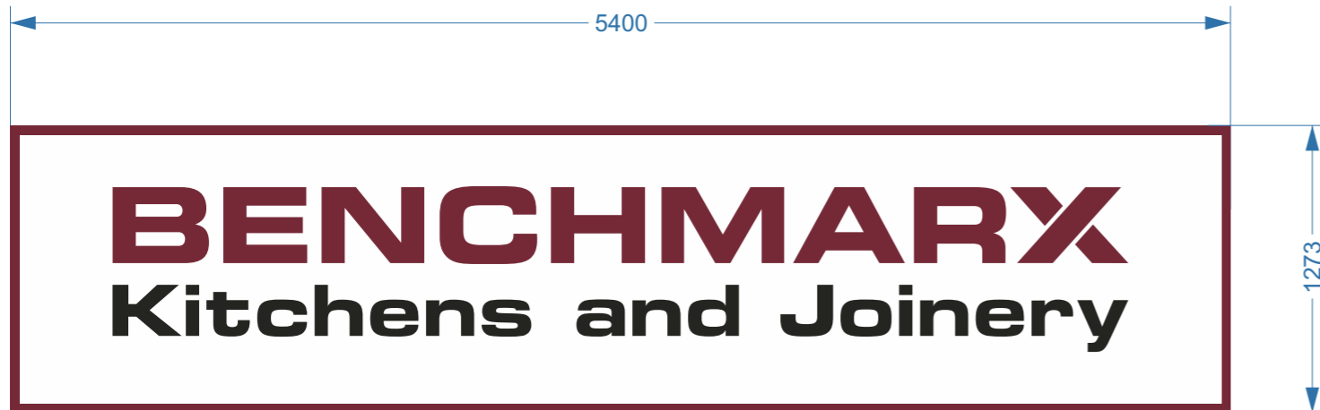
ITEM A1 | BM001 | x 1