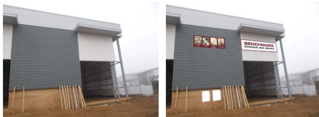
PROPOSED [INDICATIVE ONLY]

Aluminium tray with 25mm deep returns finished burgundy with applied white S/A vinyls.