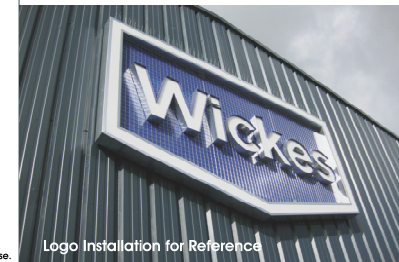
Logo Installation for Reference

This Drawing & information contained may not be copied or used without prior consent from Spencer Signs. Colour shown may not accurately match any colour references. Sizes in mm unless stated otherwise.