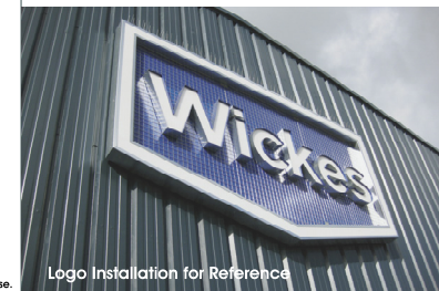
Logo Installation for Reference

Sign 4(a) - 3489 x 966mm Sign 4(b) - 4572 x 966mm Item Description: 2no sets of flat cut 3mm aluminium letters, powder coated into colour and fixed to cladding on welded studs complete with brass/nickel Locators. Overall Letter height to match Wickes 'W' and baseline height in line with shoulder of Wickes Chevron Logo. Illumination Detail: None