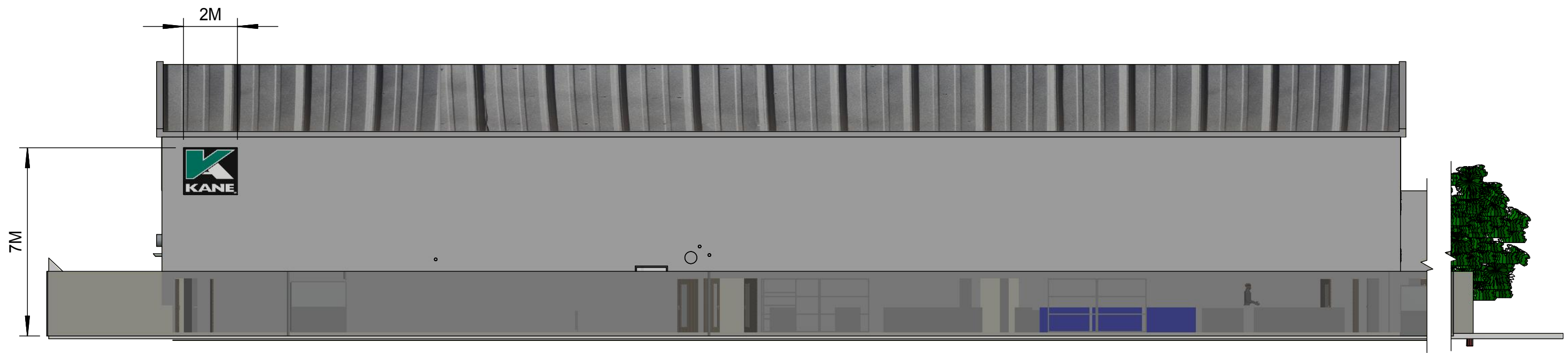
SIDE ELEVATION (EAST)