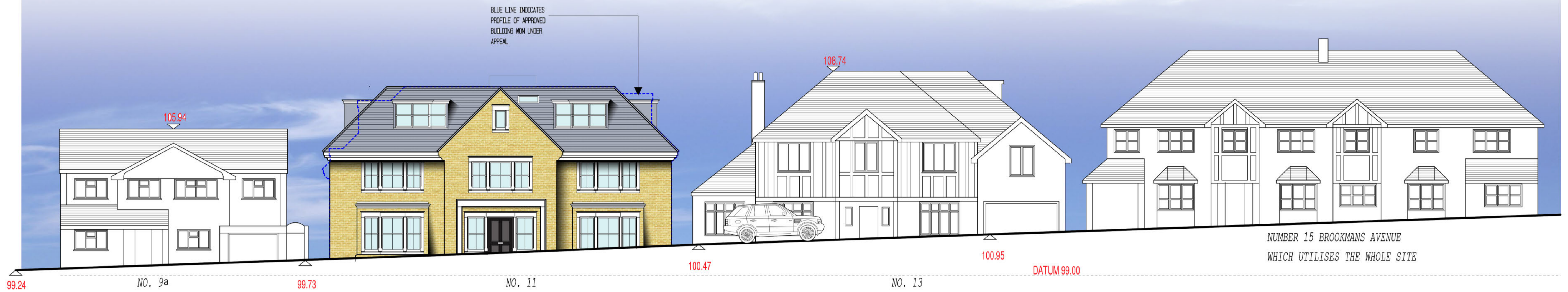
PROPOSED STREETSCENE (1.100)