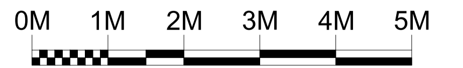
Scale Bar 1:50

CeX Ltd 11 Northburgh Street, London EC1V OAH e-mail: cexdesign@webuy.com Contractors must verify all dimensions on site before commencing work. Only work to given dimensions. The copyright of this drawing is reserved and the drawing must not be disclosed without the authority of CeX Ltd.