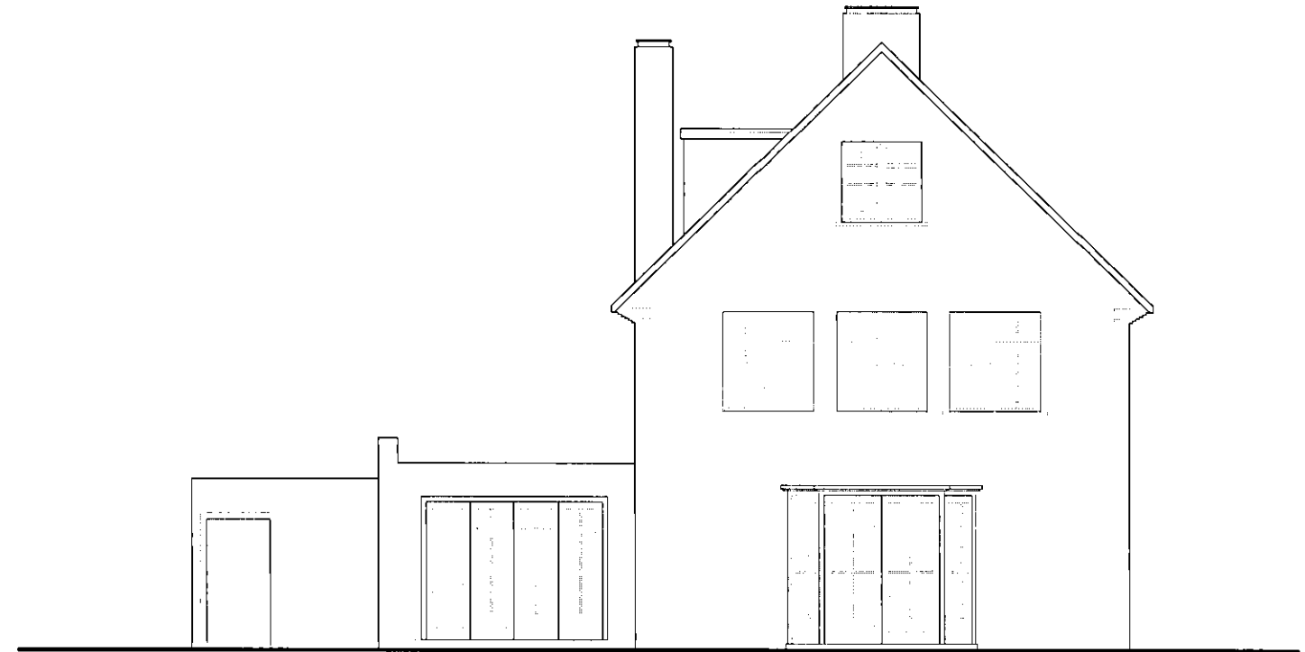
04 South East Elevation Scale 1:100