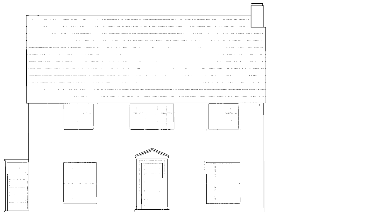
03 North East Elevation Scale 1:100