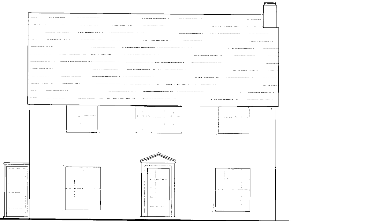
03 North East Elevation Scale 1:100