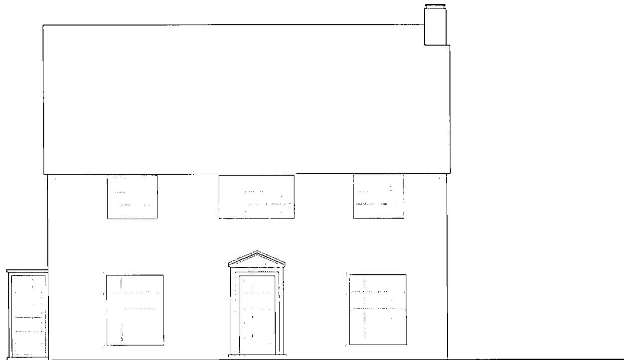
03 North East Elevation Scale 1:100