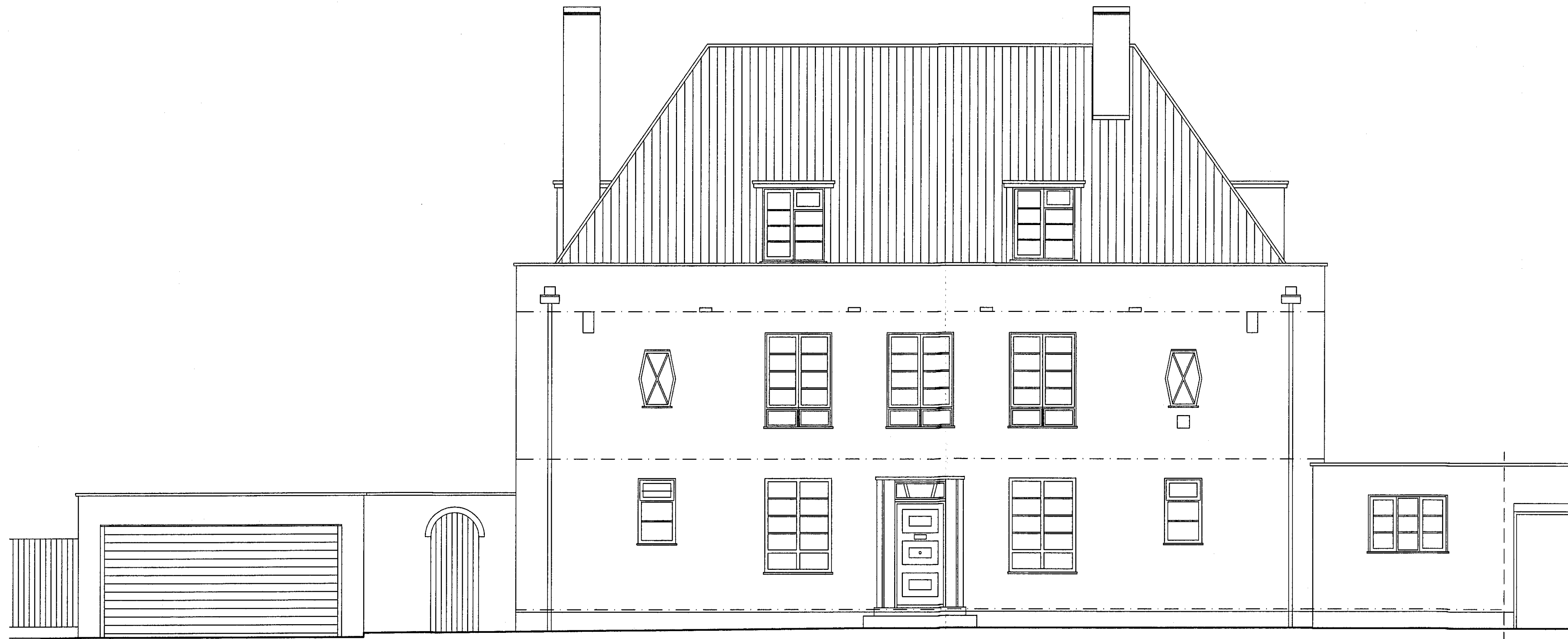
FRONT ELEVATION (NORTH EAST)