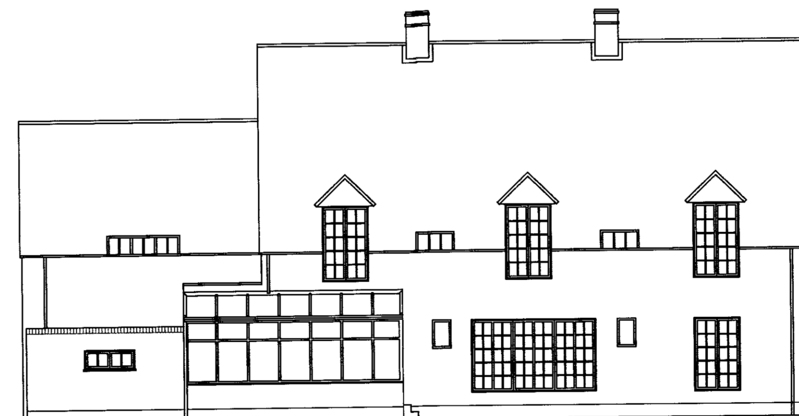
SOUTH ELEVATION EXISTING ELEVATIONS SCALE 1:100