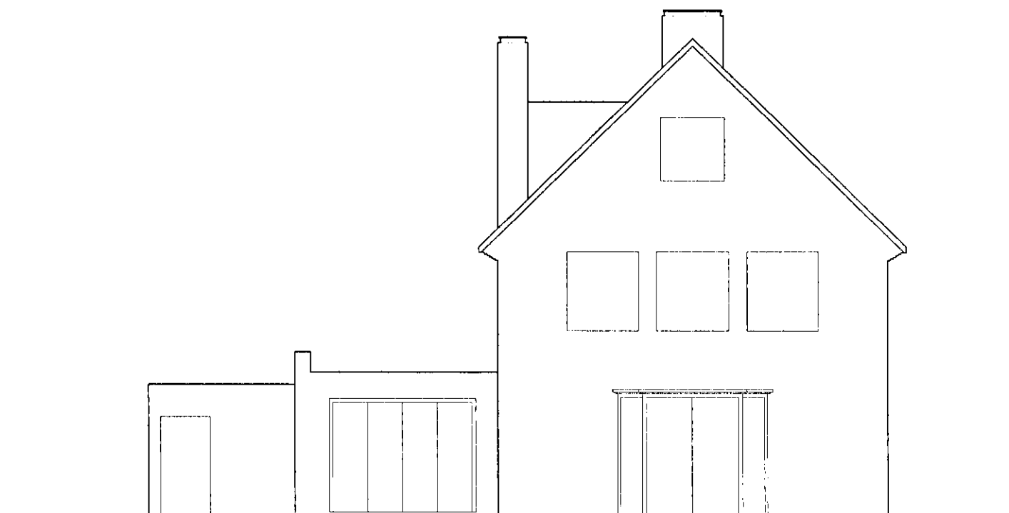
04 South East Elevation Scale 1:100