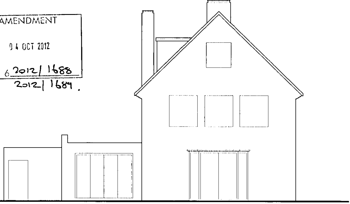
04 South East Elevation Scale 1:100

AMENDMENT 9 4 OCT 2012 NO: 6 2012/1688 2012/1689.