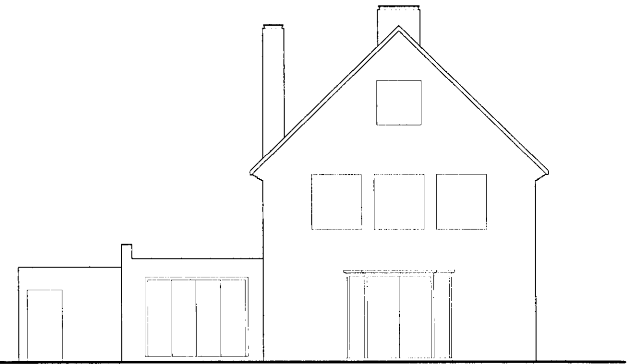
04 South East Elevation Scale 1:100