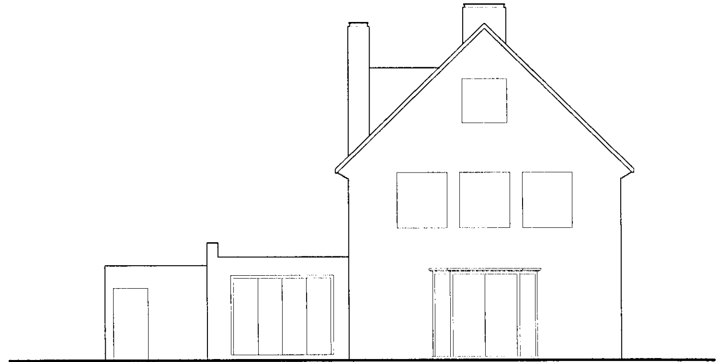
04 South East Elevation Scale 1:100