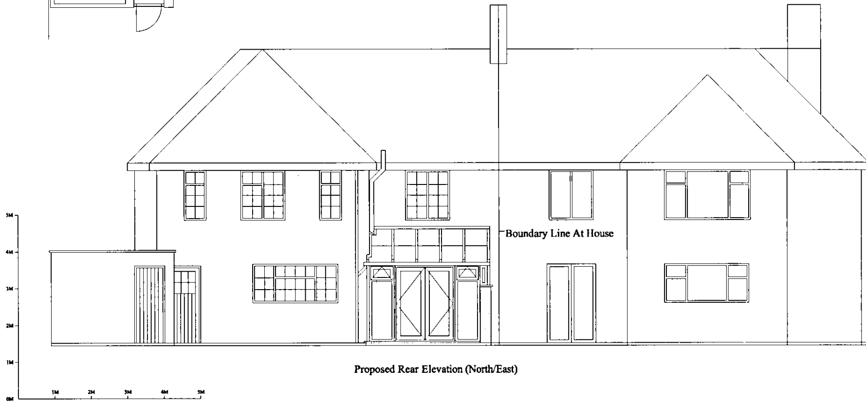
Proposed Rear Elevation (North/East)

Notes: New Conservatory - Walls - white render Frames - White PVCu Frames - Double glazed "A" rate clear tuff glass Roof - White PVCu clad aluminium Roof - Double glazed clear self clean tuff glass