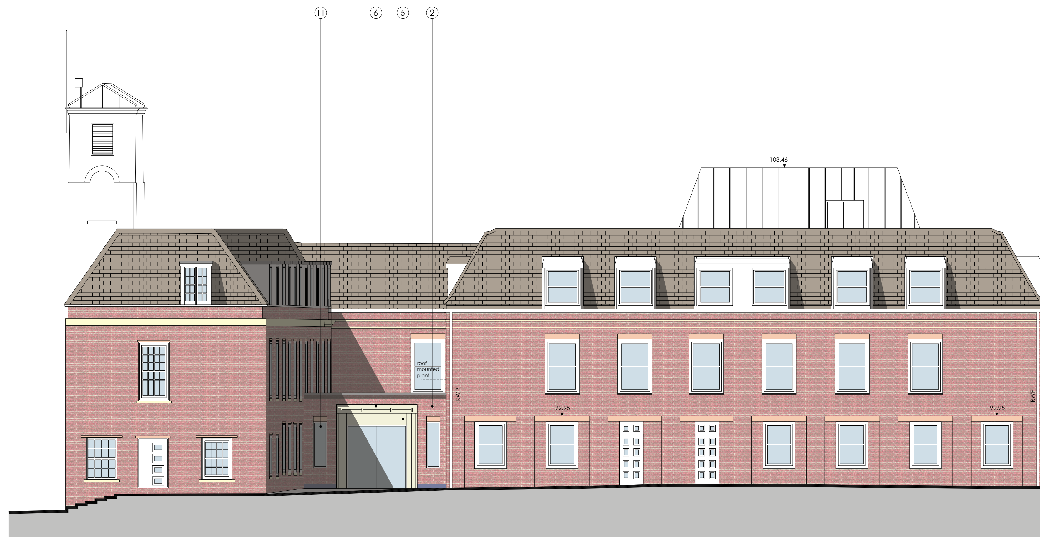
Proposed East Elevation - Single Storey Extension