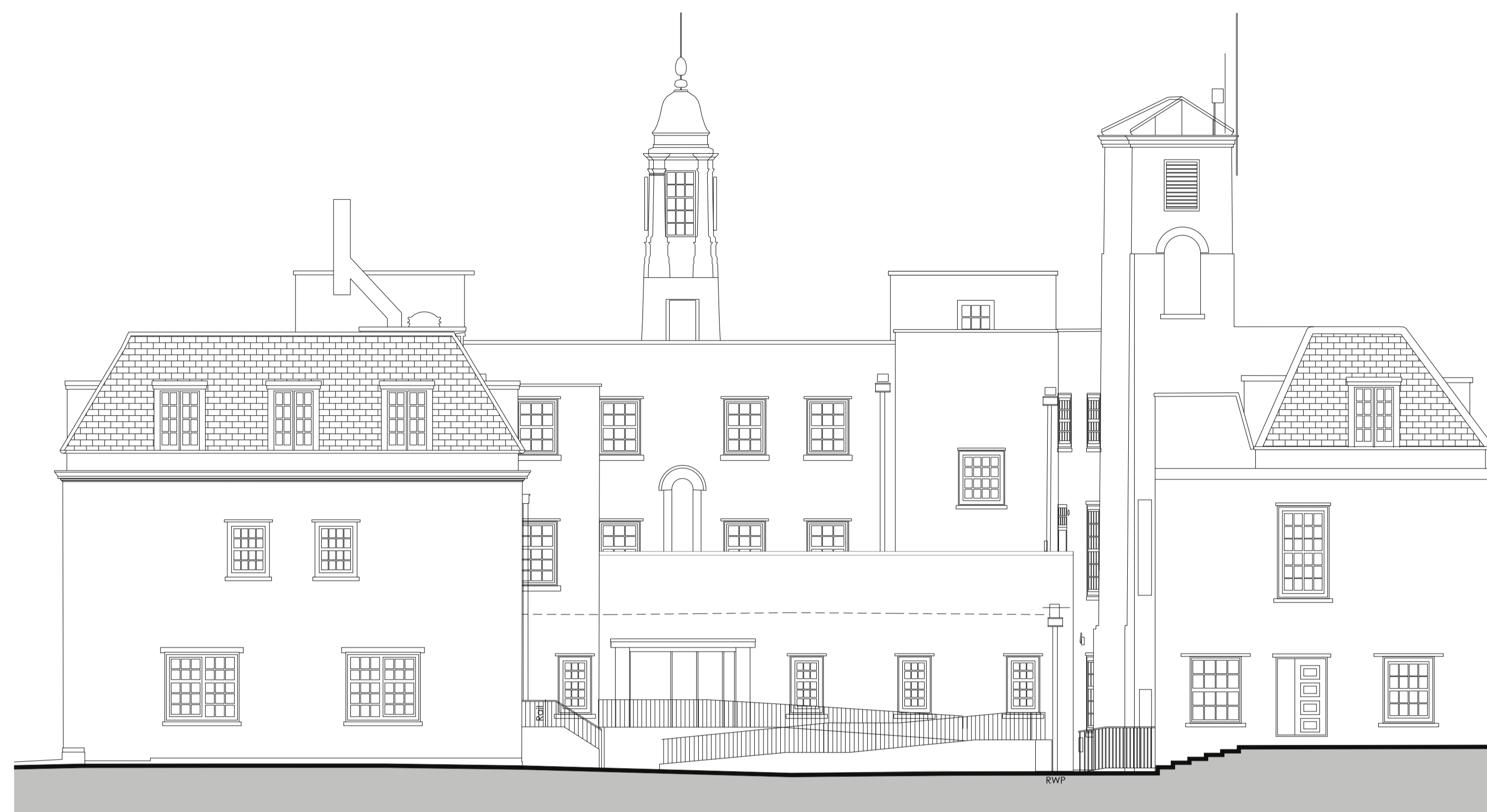
Existing Elevation Facing Car Park