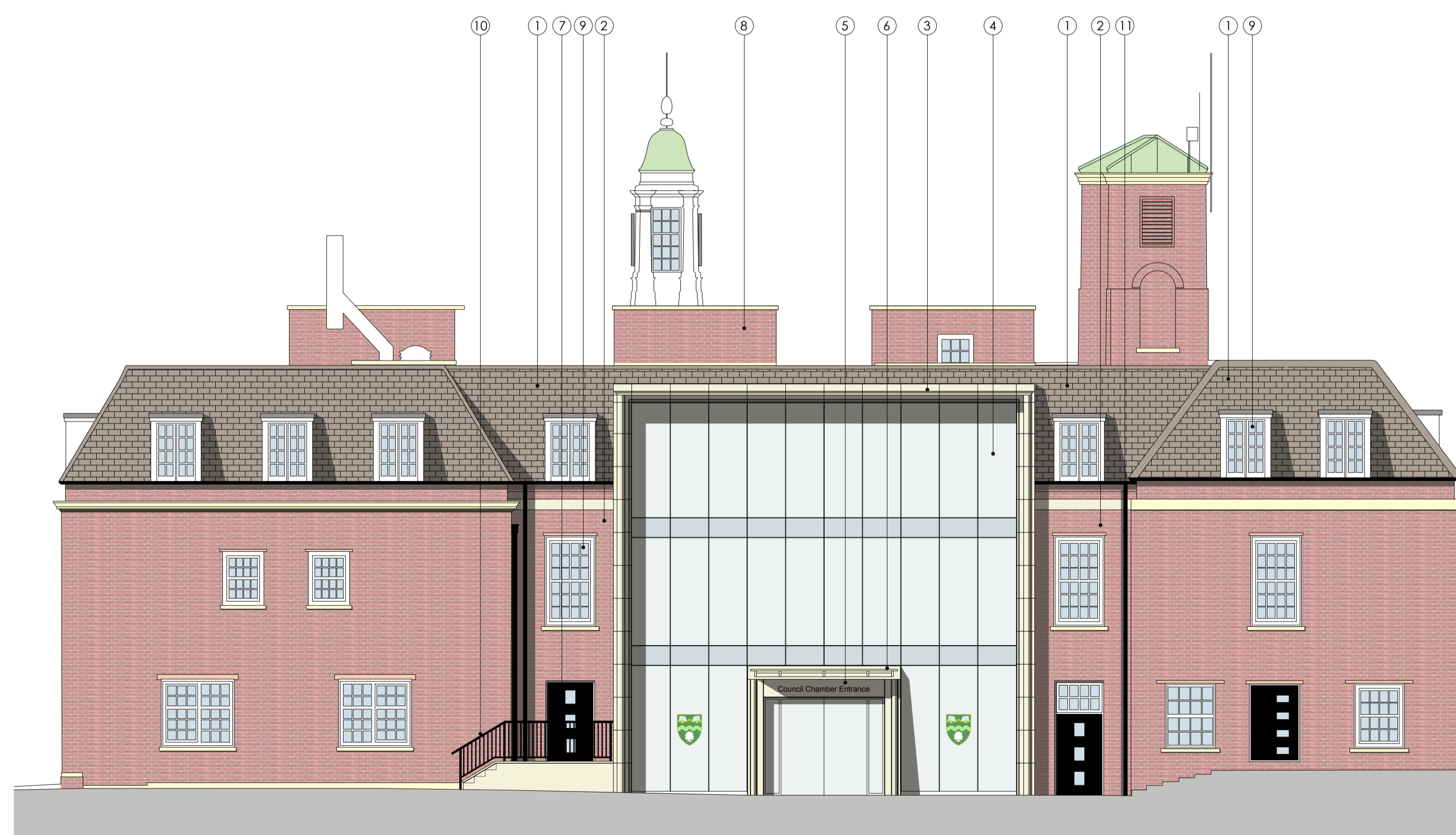
Proposed Elevation Facing Car Park - Three Storey Extension