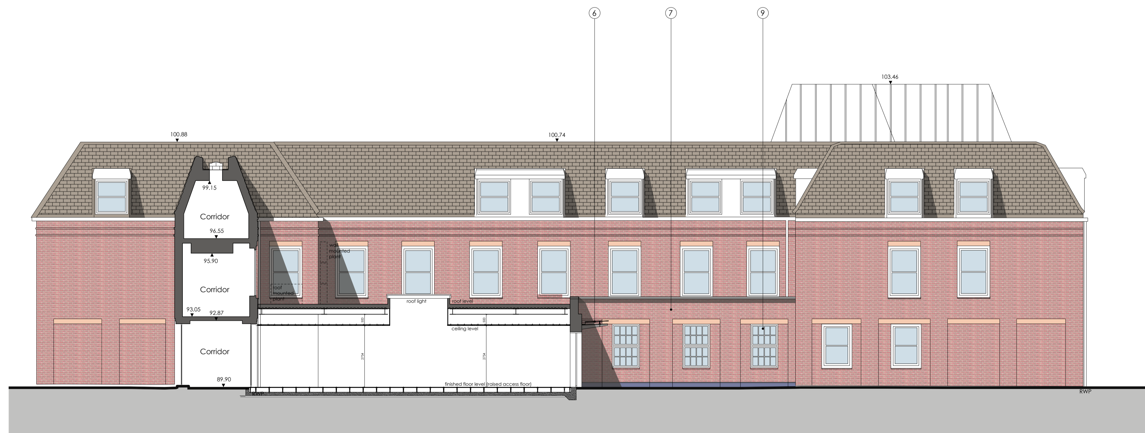
Proposed Elevation / Section - Single Storey Extension