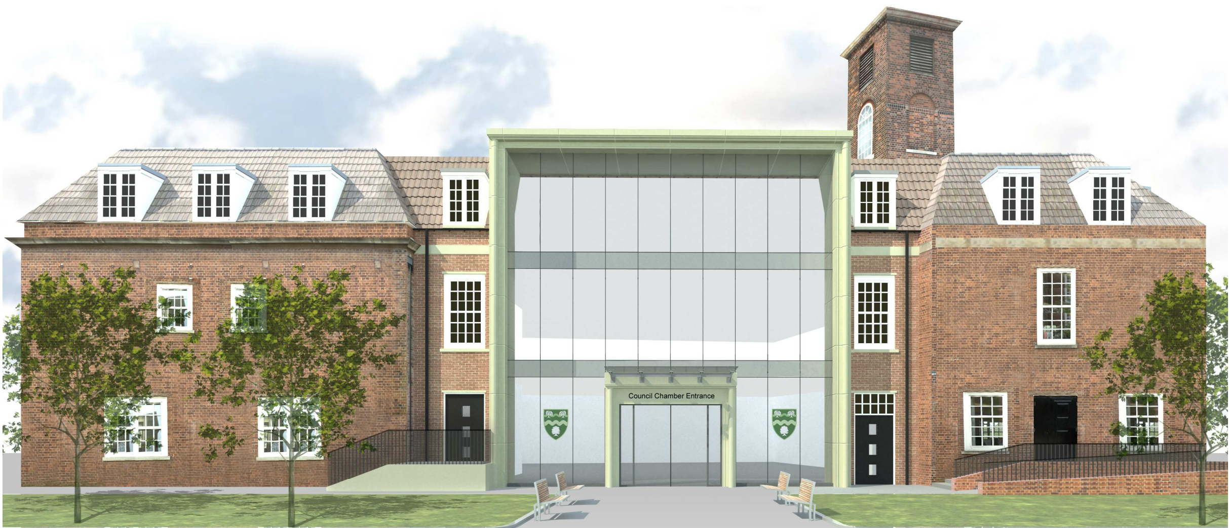
Perspective View 3