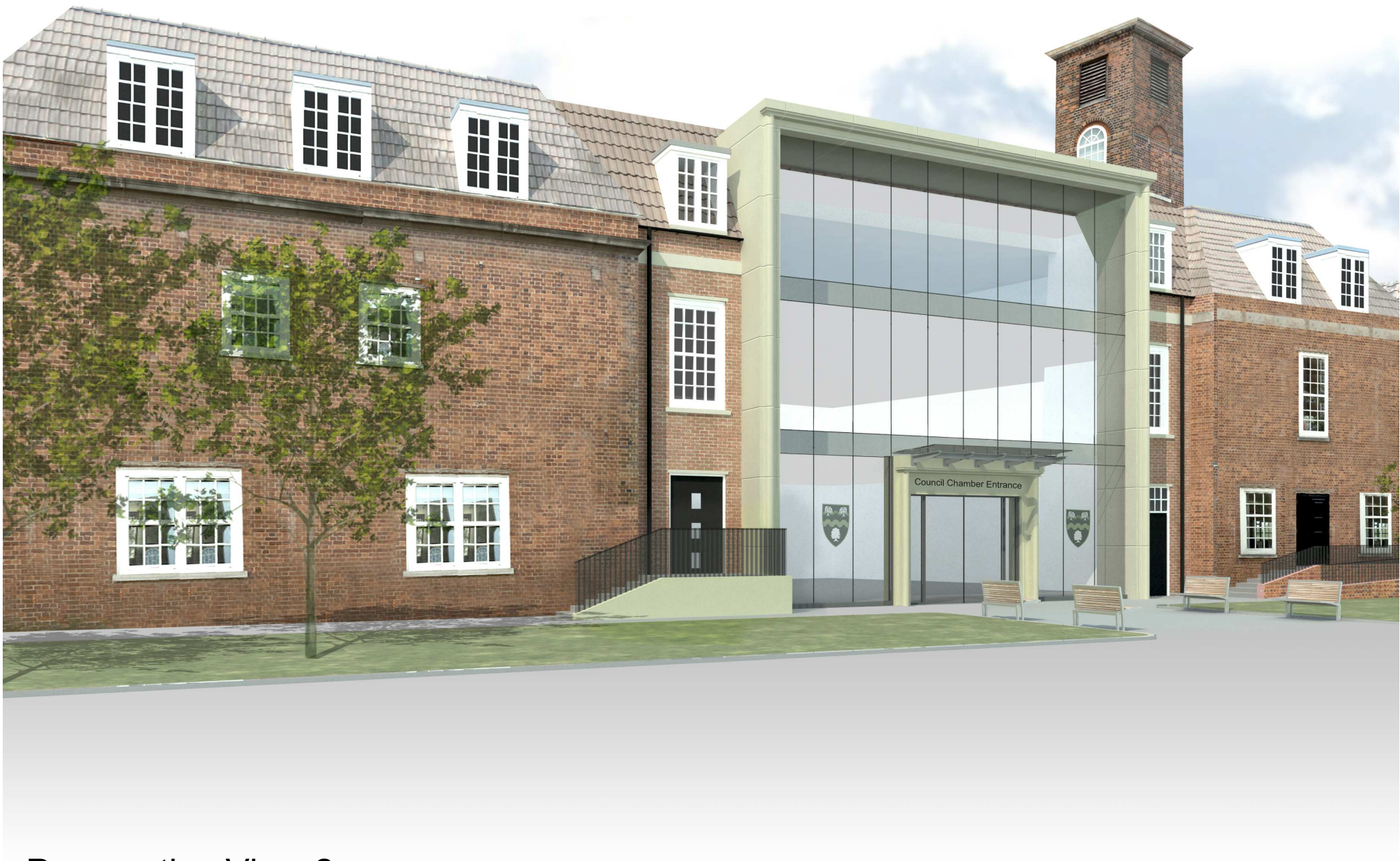
Perspective View 2