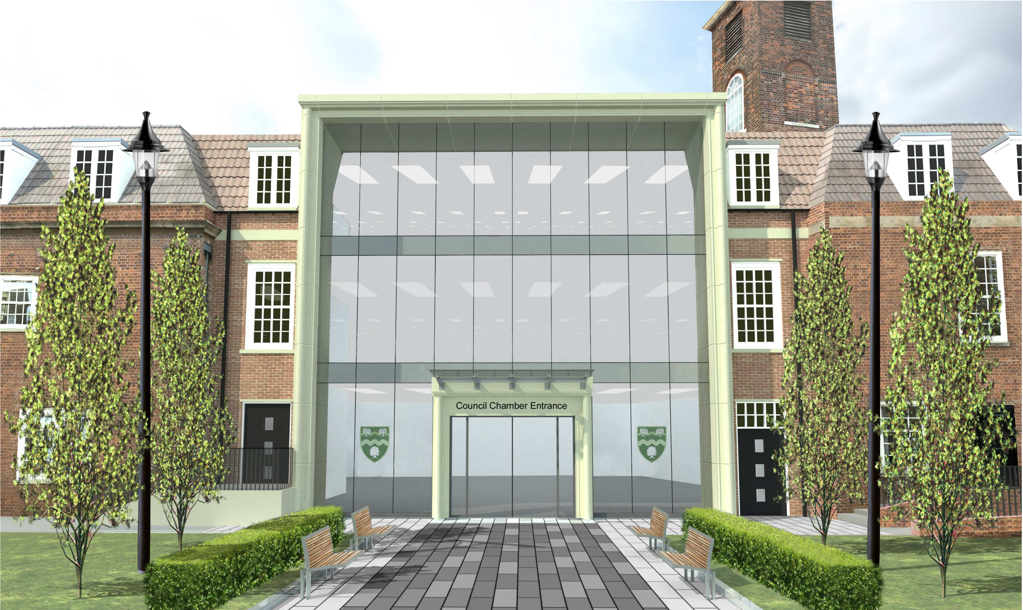
Perspective View 1