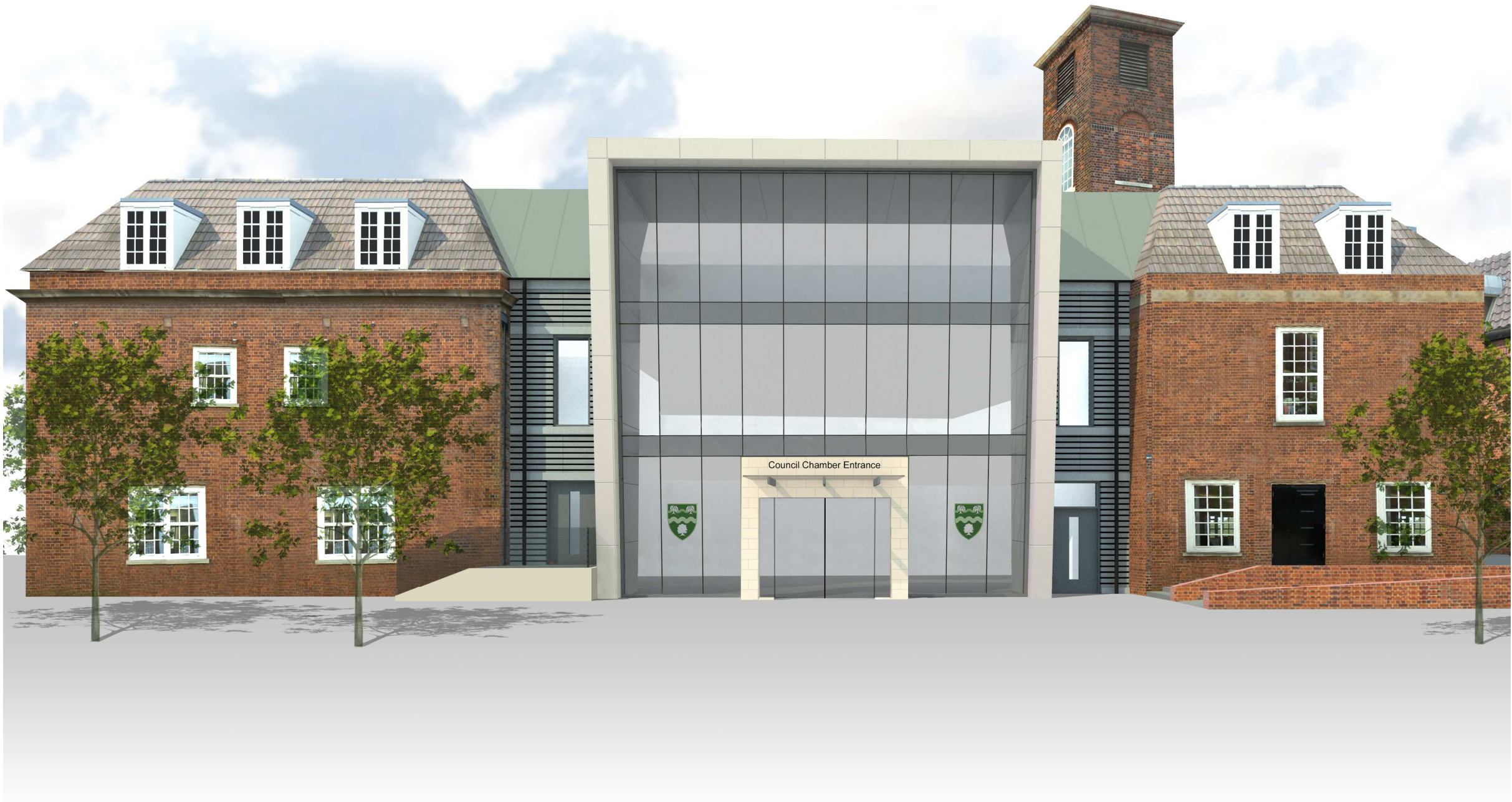
Perspective View 3