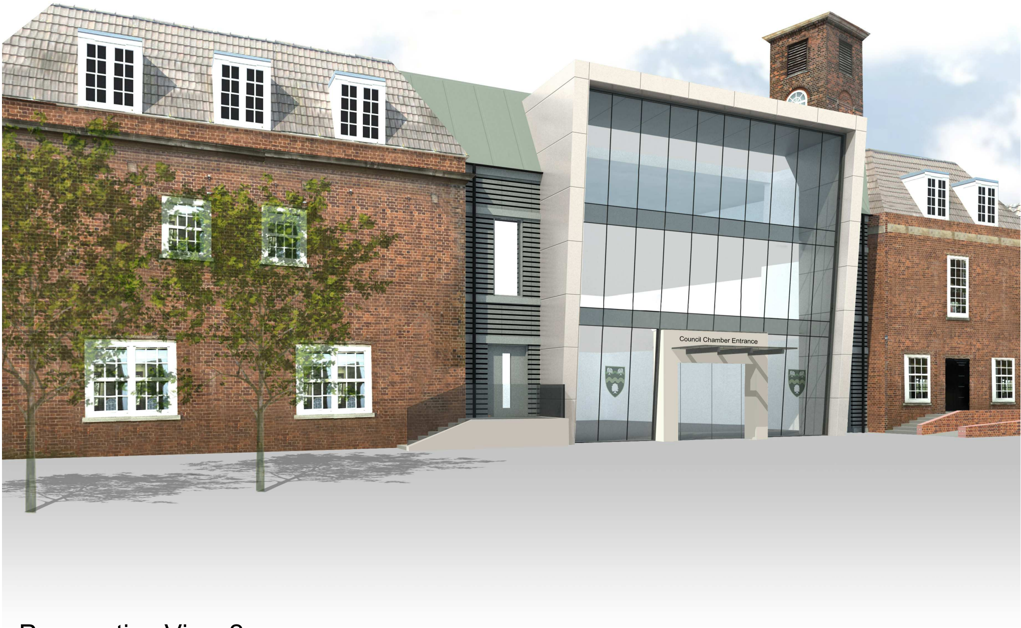
Perspective View 2