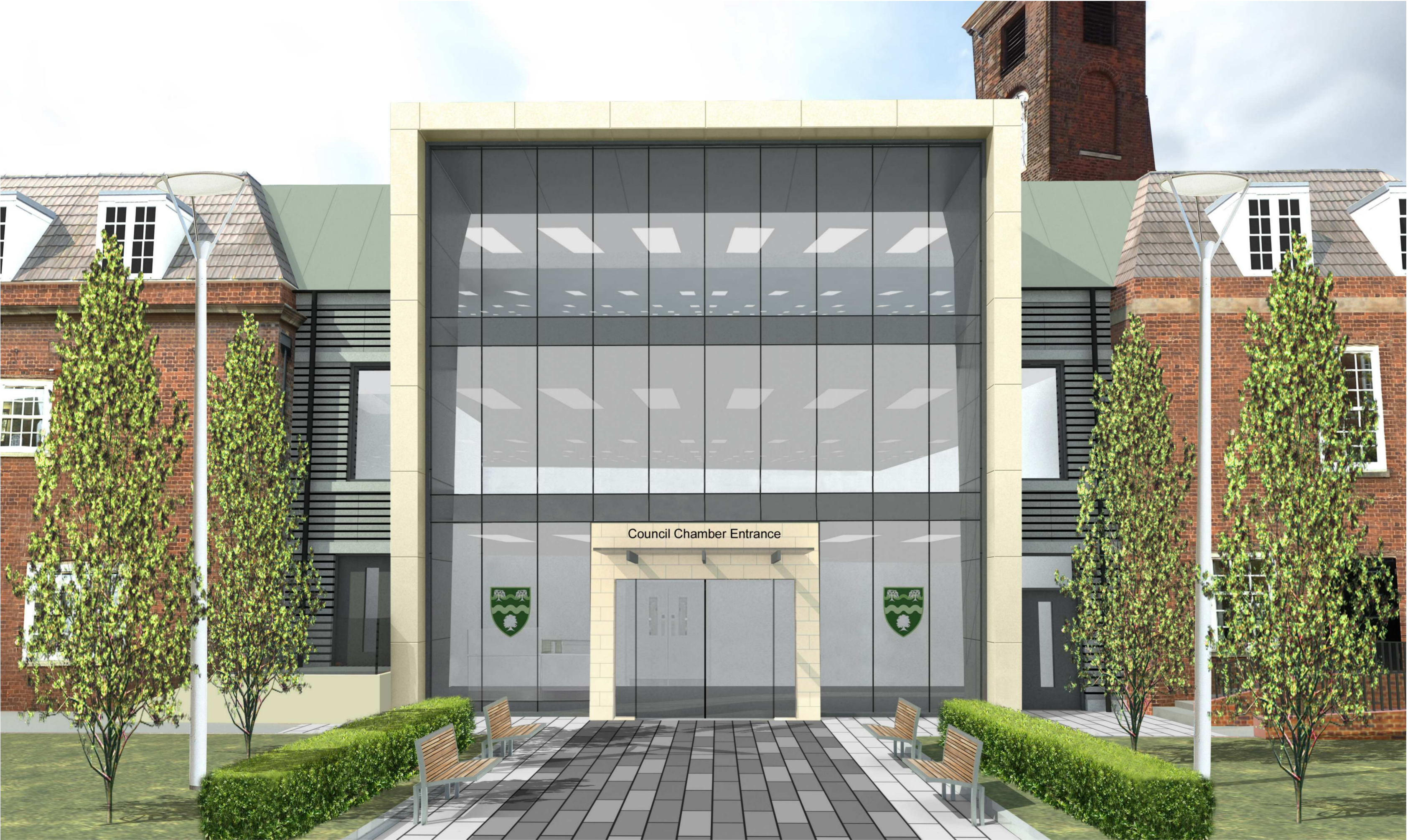
Perspective View 1