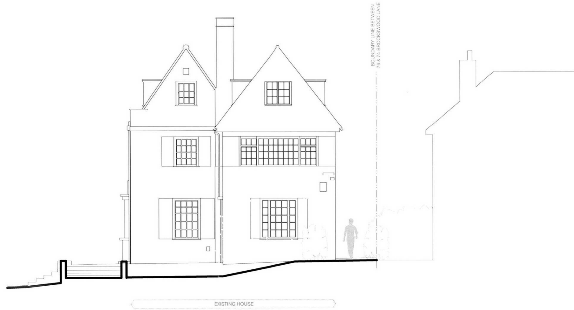
End Elevation Facing South (towards Brockswood Lane)