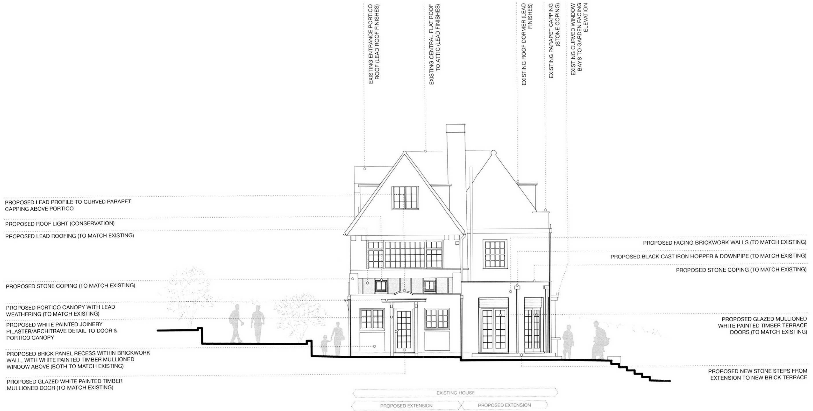
End Elevation Facing North (towards poolhouse)