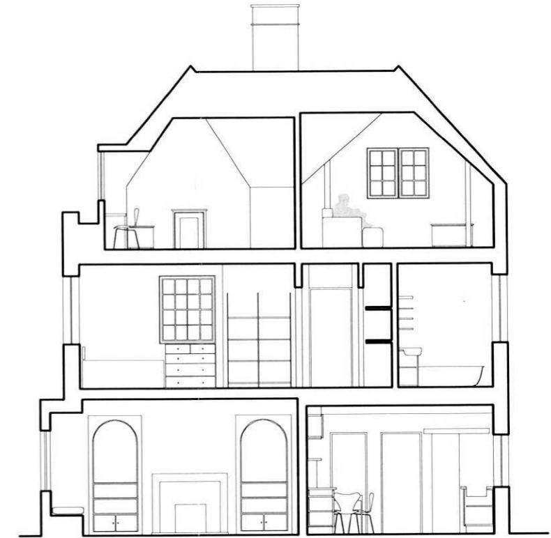
Typical Short Section Through Existing House