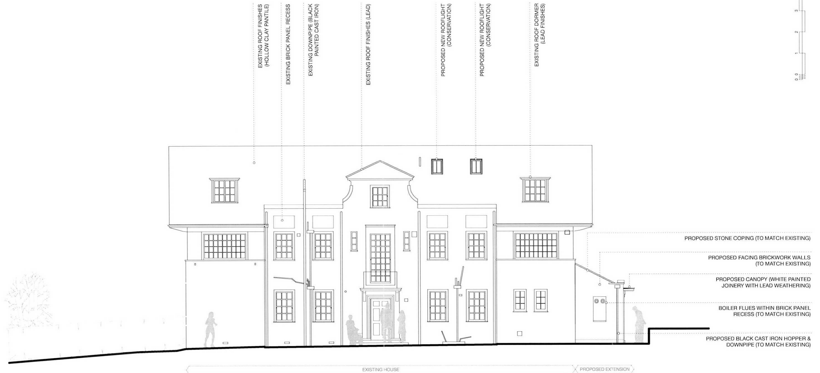
Rear Elevation Facing East (towards neighbouring house)