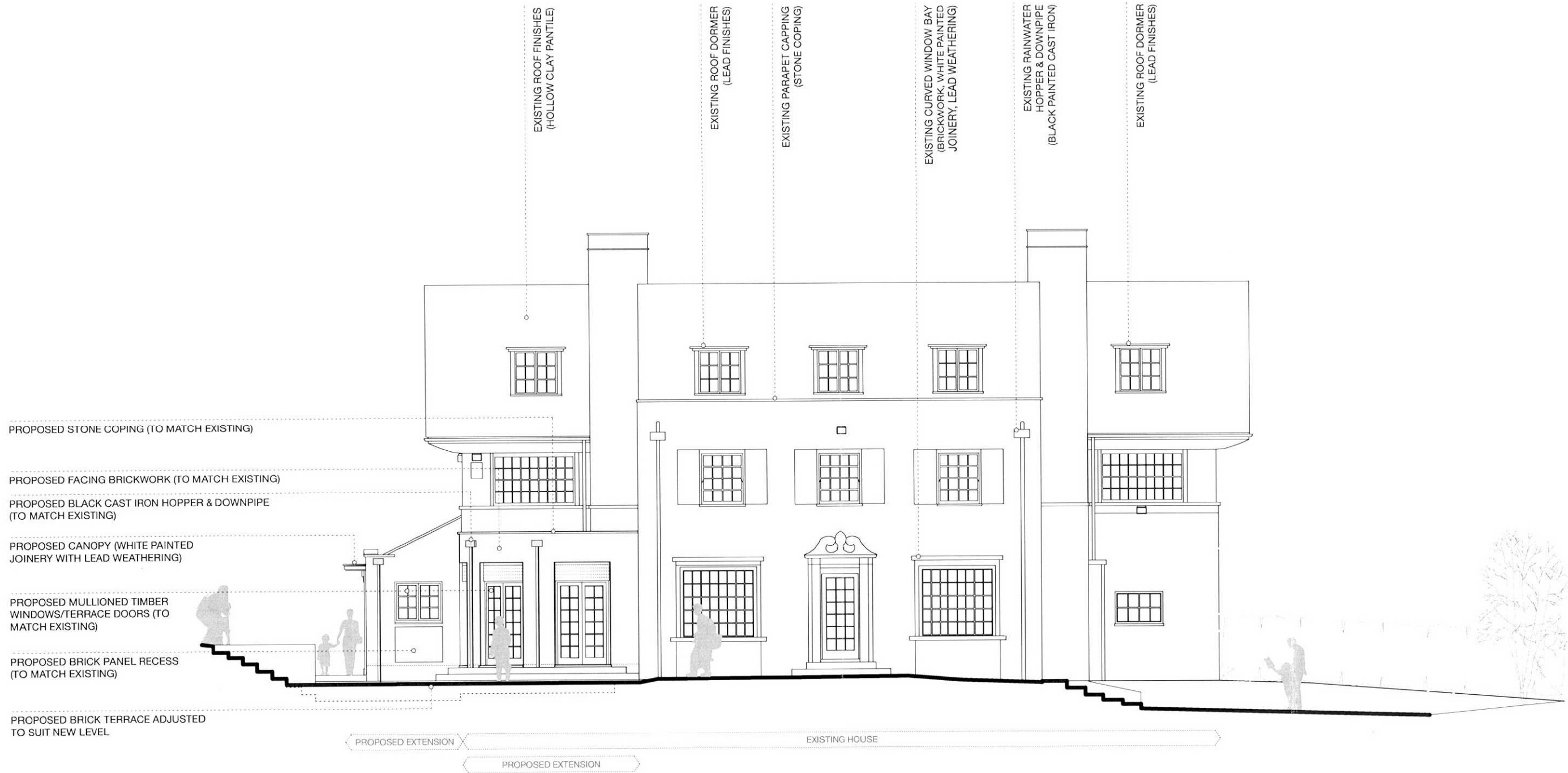
Front Elevation Facing West (towards garden)