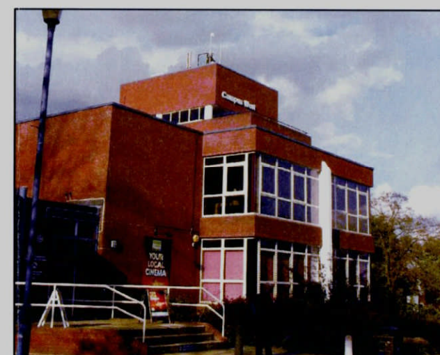
VIEW OF BUILDING