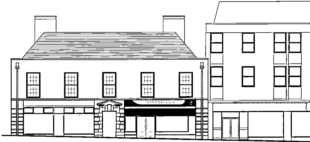
EXISTING STREET SCENE