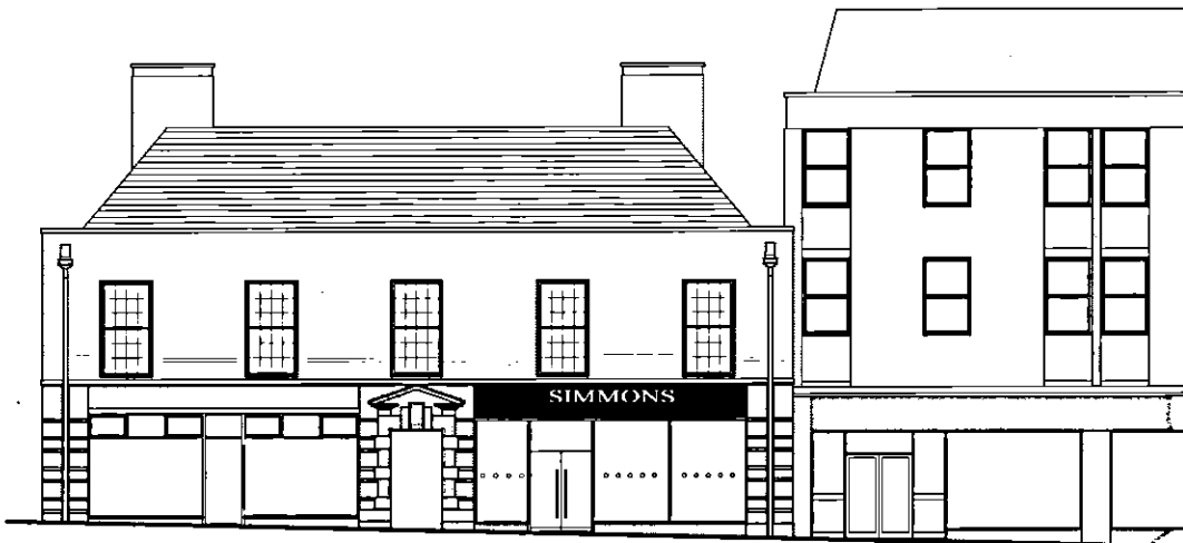
PROPOSED STREET SCENE