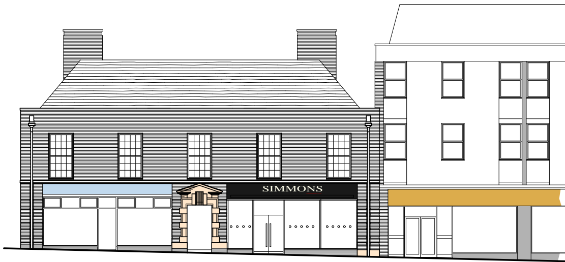
PROPOSED STREET SCENE