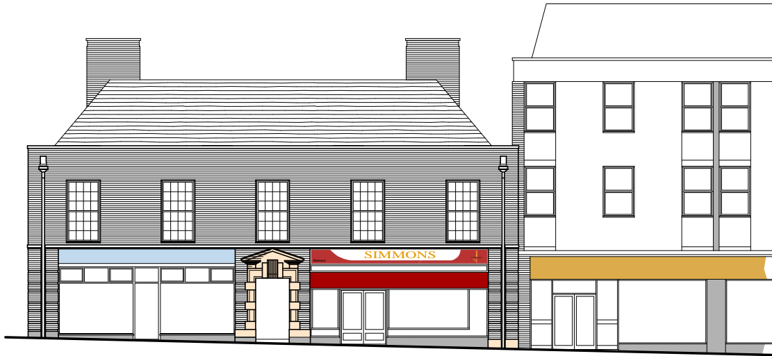
EXISTING STREET SCENE