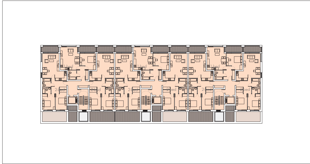
Typical Floor Plan Building K

Situated to the south of the Civic Square and adjacent to the main pedestrian approach from the city Building K is the northernmost of the residential buildings within the master plan. A simple rectangular building, it is orientated with its principal facade facing north across the square and its flank walls adjacent to the internal Spine Road and the pedestrian entrance to the gardens.