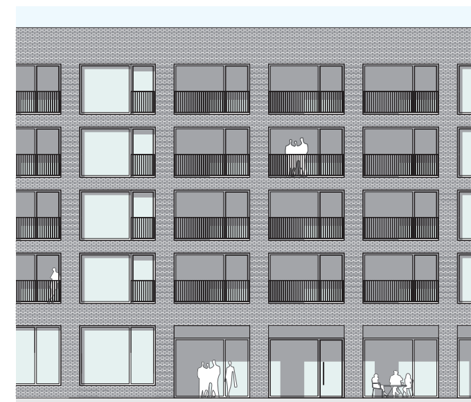
Bay study north

In contrast to the white buildings of the Shredded Wheat Factory Building K's materials are chosen to reflect the more traditional materials predominant in the Welwyn area. Red brick is therefore proposed for the masonry elements. Perforate screens are articulated in vertical timber louvers and metal is used for the balustrades and window frames.