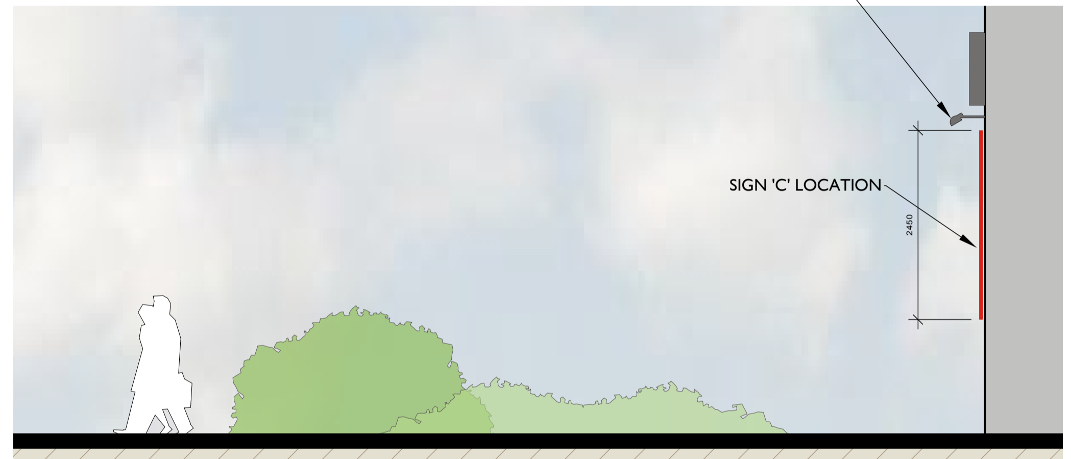
INDICATIVE SECTION C-C SCALE 1 : 50