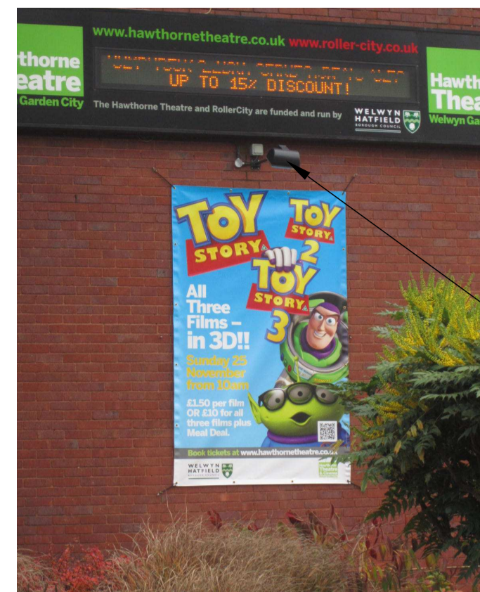
TYPICAL SIGN IN POSITION

SIGNAGE ILLUMINATION FIXED APPROXIMATELY 4.2M ABOVE GROUND AND PROJECTING AROUND 500mm FROM WALL