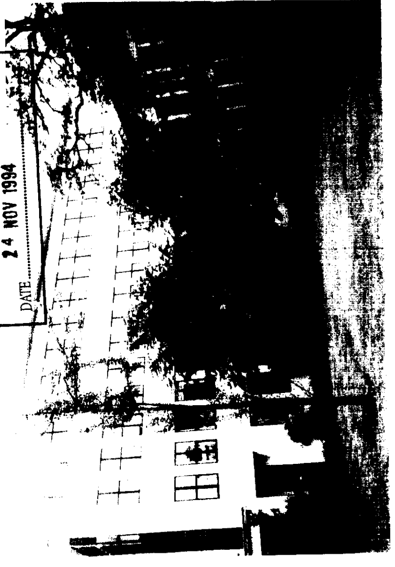
BUILDING 3 EAST FACE.