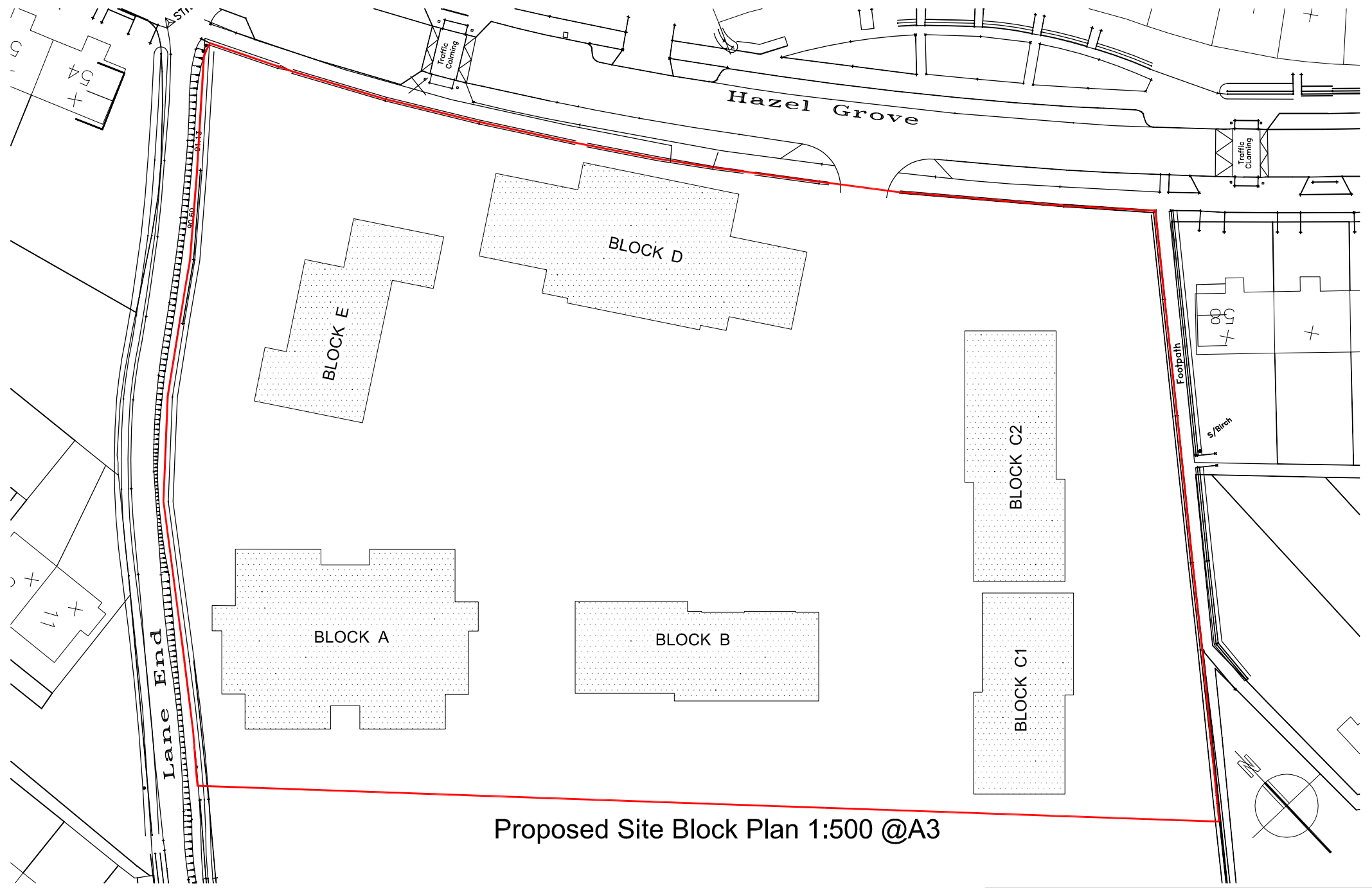
Proposed Site Block Plan 1:500 @A3