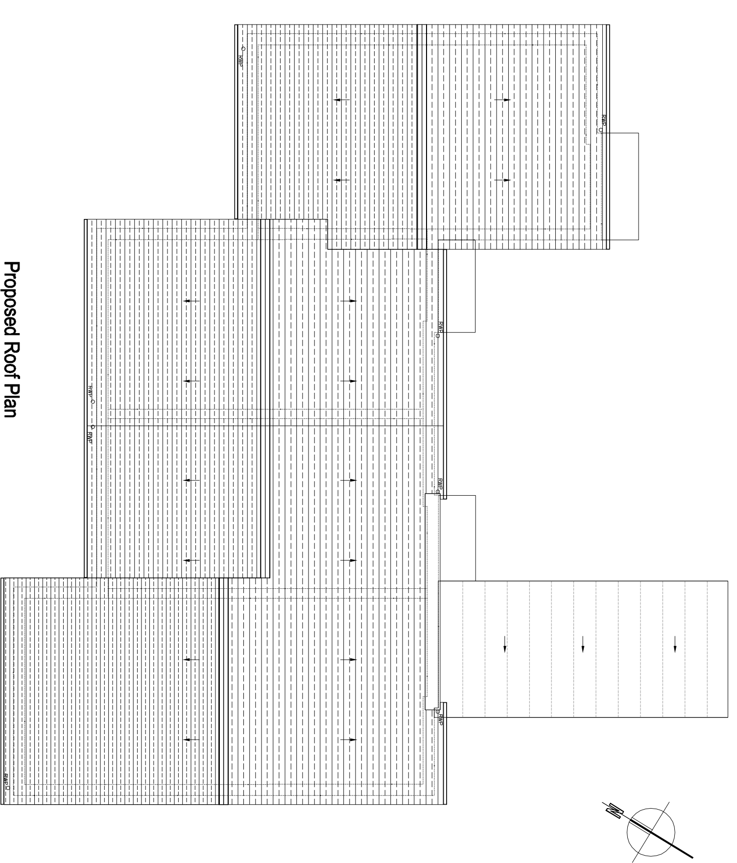
Proposed Roof Plan