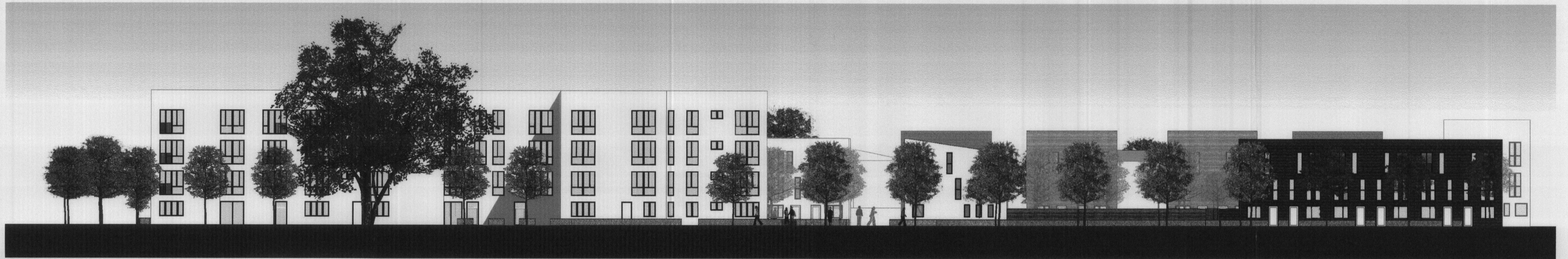
02 - North elevation of Block 2 and 3