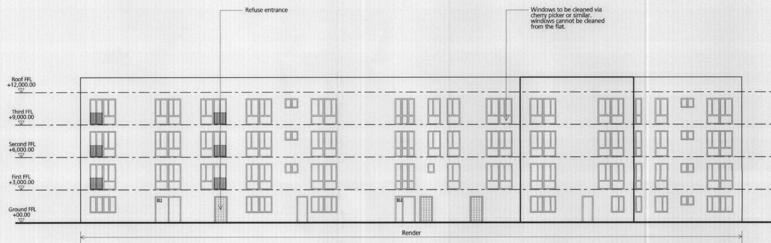
A- Elevation - North