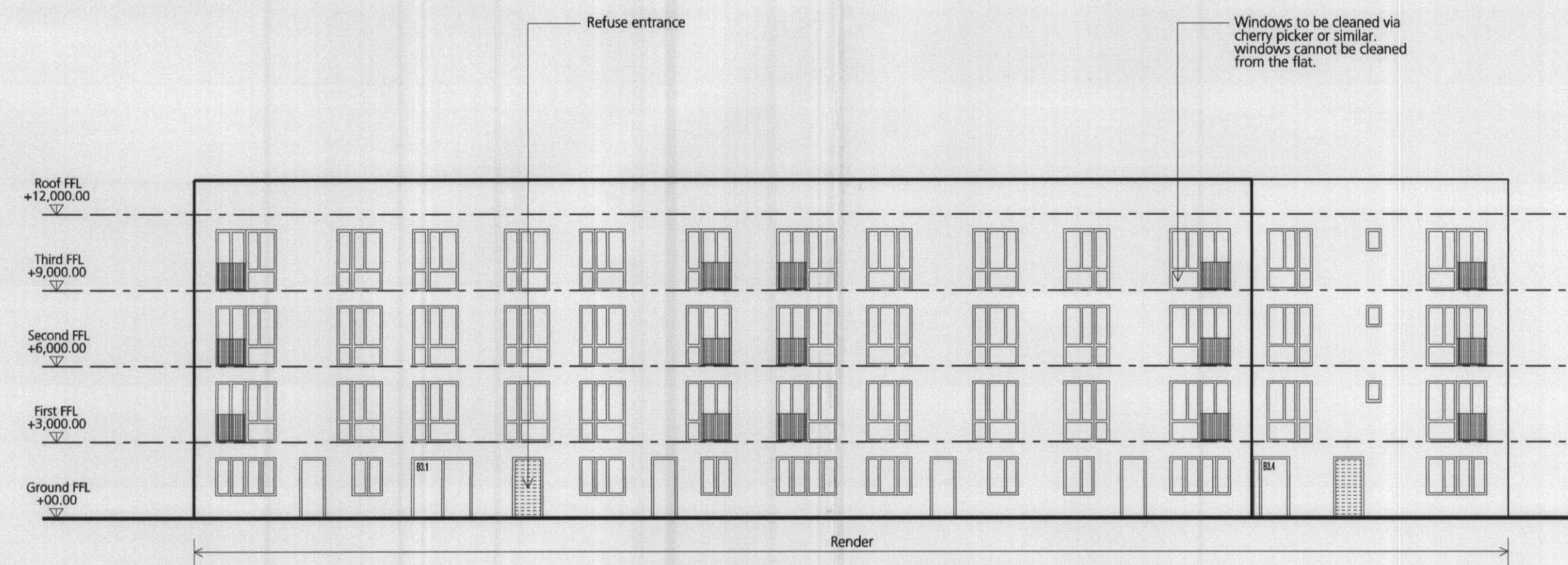
D- Elevation - East - Broadwater Road

WELWYN HATFIELD PLANNING OFFICE COPY 02 JUN 2009 NO: N6/2009/1053/MA N6/2009/1054/LB