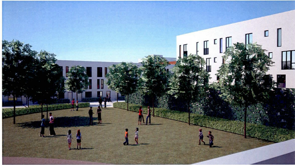
03 - View towards open space