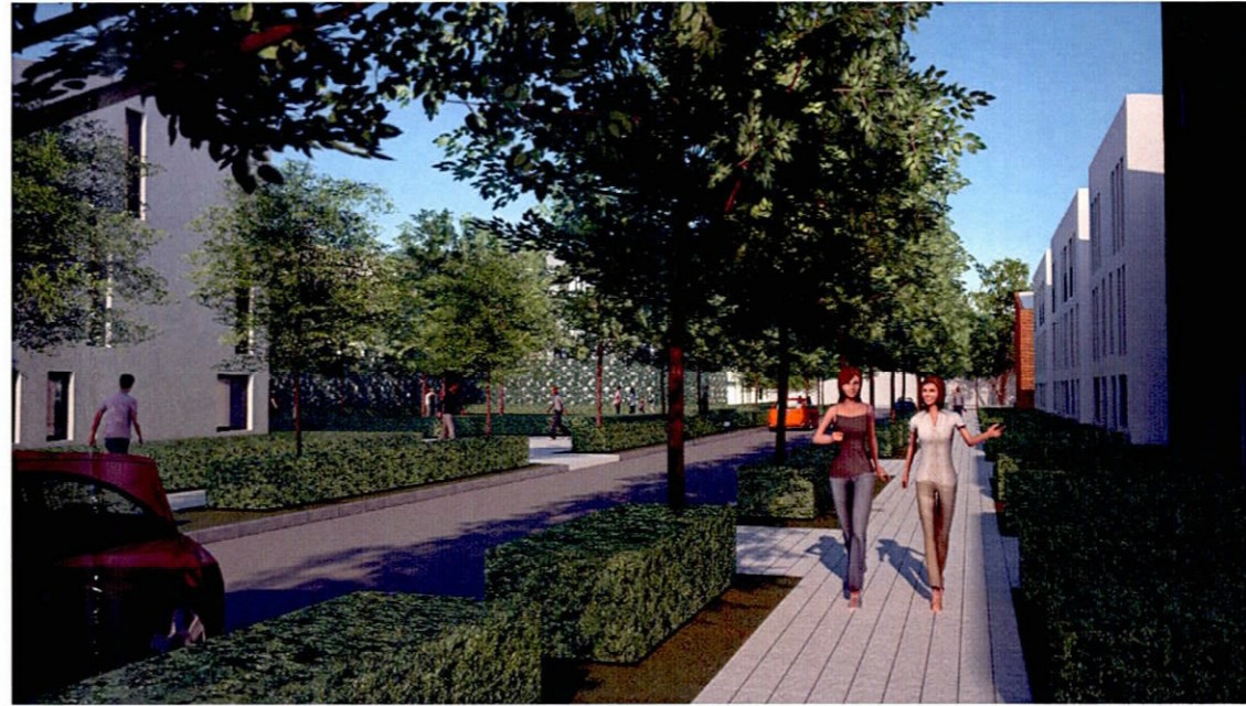
02 - Street view towards Broadwater Road