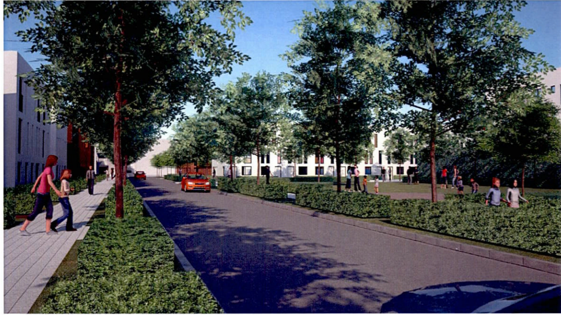
01 - Street view from Broadwater Road