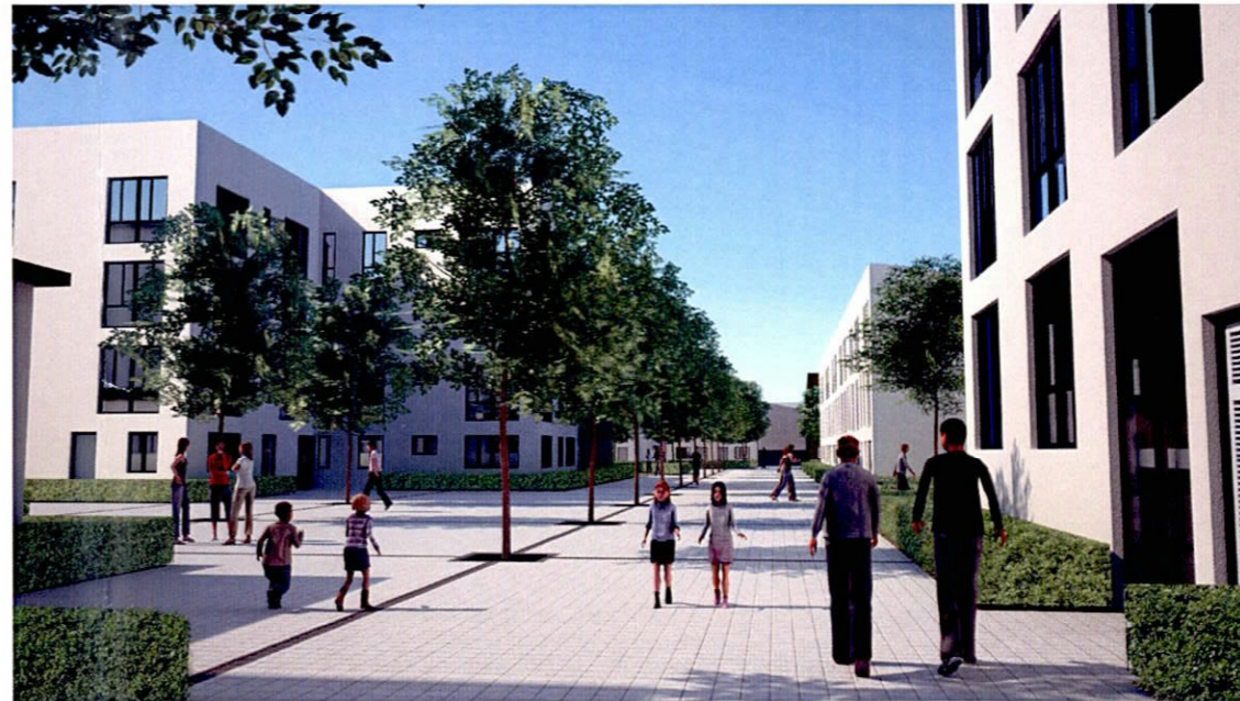
03 - Street view towards Block 1