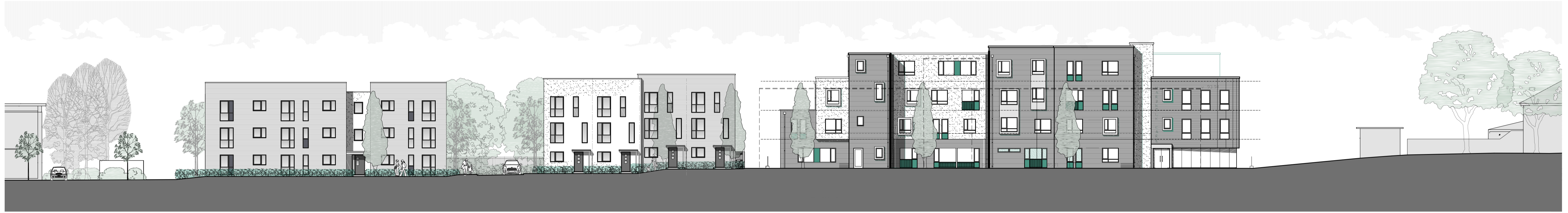
BROADWATER ROAD STREET SCENE 1:200