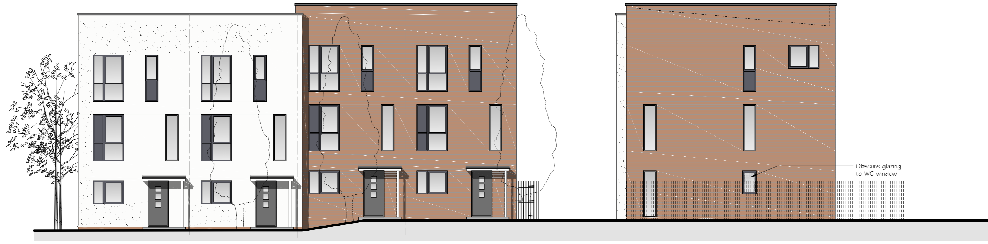
Plot 4 Plot 3 Plot 2 Plot 1 FRONT ELEVATION