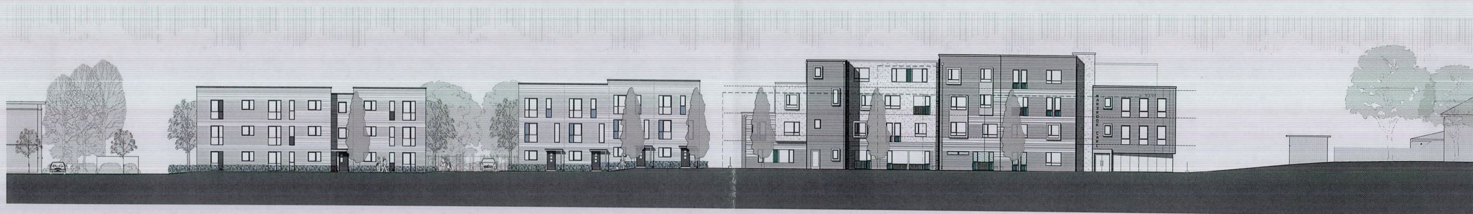
BROADWATER ROAD STREET SCENE 1:200