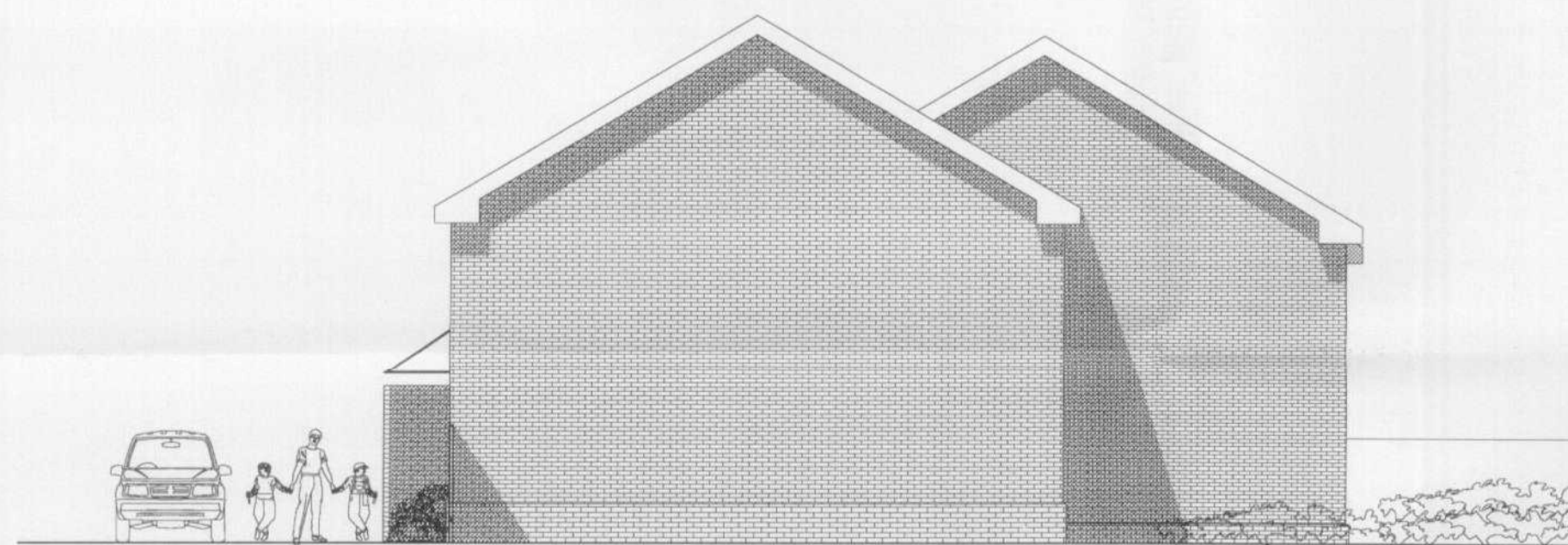
Hazel Grove Side Elevation