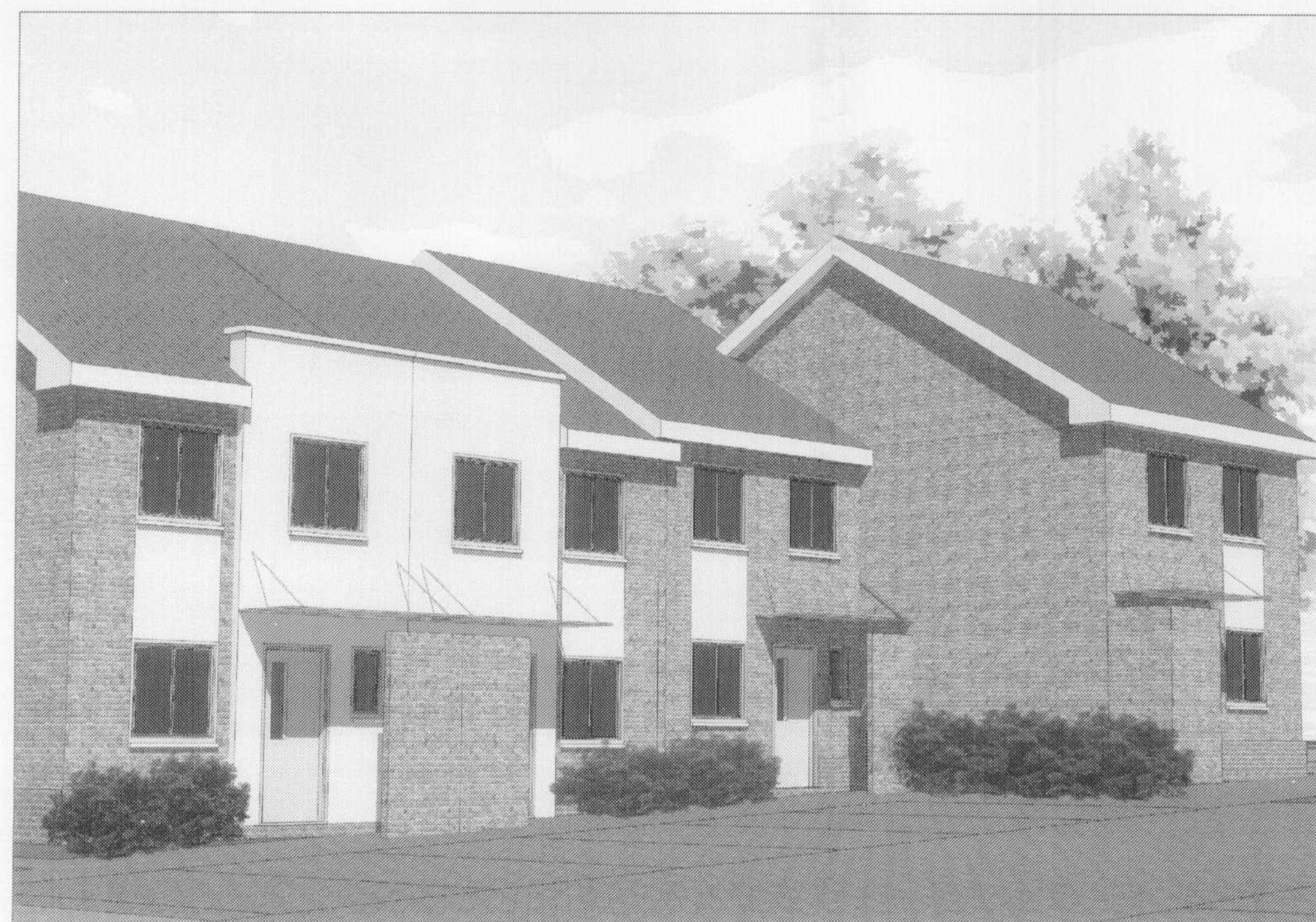
Front Streetscape View