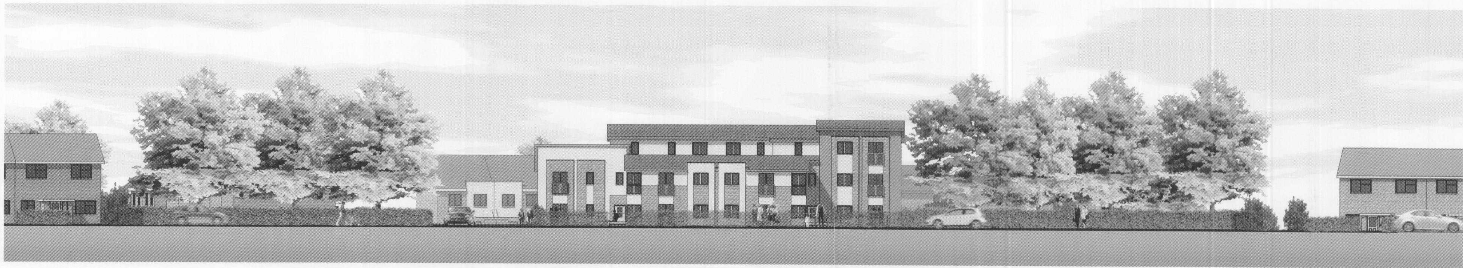
Hazel Grove Elevation A-A